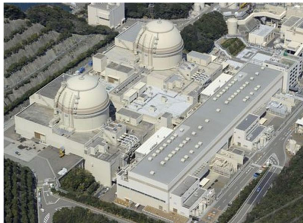
Buildings housing Oi reactors 3 and 4 in Kyodo photo in 2000

a 15% electricity shortfall in the summer. This gap could not be overcome through power saving and any power cuts that might arise would endanger people's lives and cause disruption. Stressing the continued importance of nuclear power, Noda announced that the government would produce a long-term energy plan in August.