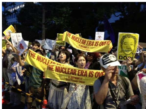
The Nuclear Era is Over if you want it

The main chant that I heard was 'No Restarts!' ( saikado hantai ) which people were shouting together in response to cheerleaders with megaphones and groups of drummers spaced out down the line. By around 7.30 it was deafening. Earlier, other slogans were shouted, usually to a drum beat, such as 'Give Back Fukushima!' ( fukushima kaese ), 'Noda Quit!' ( noda yamero ), and one I heard in English, 'Shame on TEPCO!'. There was also no shortage of flags, signs and banners of varying sizes and qualities, in Japanese, English, and both, all with messages against nuclear power, the restarts and the Noda administration. Many of these were home made and original, expressing the sentiments of those who created and carried them. Some also drove past in trucks decked out with banners. The atmosphere was that of a very well-behaved, yet very angry, carnival. It dispersed quickly and calmly at 8 p.m. as planned when the organizers called a halt.