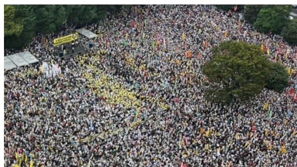
Tokyo Demo on the anniversary of 3.11 disaster