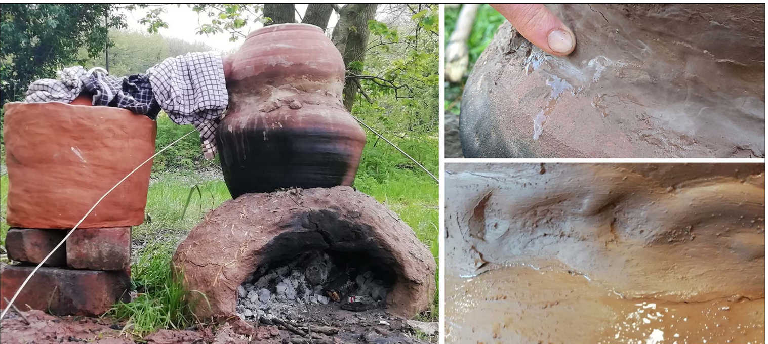
Figure 3. Complete experimental apparatus (left) and distillate leaking through a channel created at a contact point between the still body and head (right) (after Groat 2023: fig. 59).