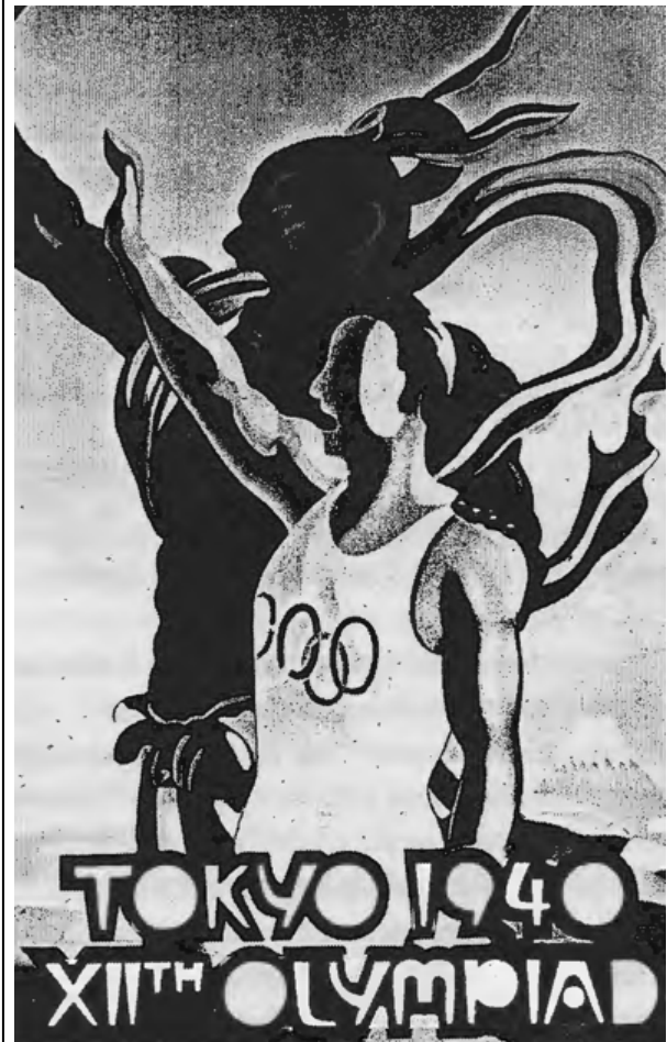
Figure 2. Wada Sanzo, Poster for the 1940 games.

Along with the Olympics, there was another important international event that was planned to take place in Japan that year: The Tokyo Exhibition. It was conceived as a World's Fair, and for this event as well, the state made significant investment. The Wolfsonian in Florida houses a few postcards that portray building plans designed for the occasion (Figure 3). Monumental buildings in these postcards, like the graphic designs for the Olympics, use a modernist visual language that prefers clean lines, geometric abstraction, and minimal decoration, which make the designed buildings resemble the architecture in other