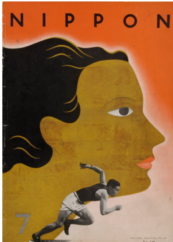
Figure 1. Takashi Kono, Issue 7 of Nippon magazine, 1936.