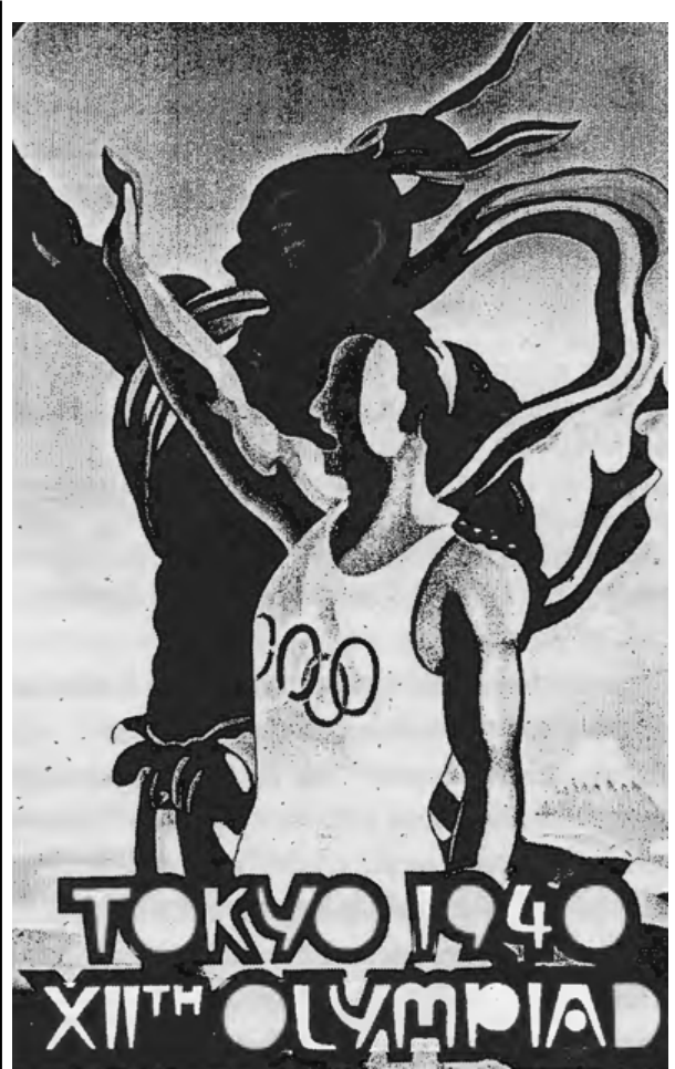
Figure 2. Wada Sanzo, Poster for the 1940 games.

Along with the Olympics, there was another important international event that was planned to take place in Japan that year: The Tokyo Exhibition. It was conceived as a World's Fair, and for this event as well, the state made significant investment. The Wolfsonian in Florida houses a few postcards that portray building plans designed for the occasion (Figure 3). Monumental buildings in these postcards, like the graphic designs for the Olympics, use a modernist visual language that prefers clean lines, geometric abstraction, and minimal decoration, which make the designed buildings resemble the architecture in other