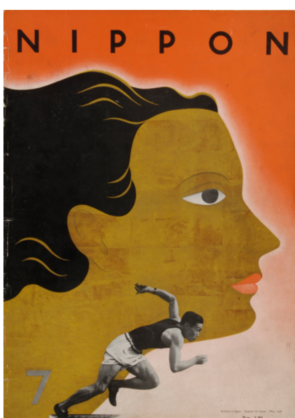
Figure 1. Takashi Kono, Issue 7 of Nippon magazine, 1936.