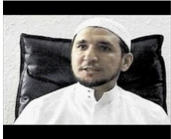
Mohammed Jamal Khalifa

It seems clear that the 1980s official USG block against antiterrorism actions that might embarrass the Saudis was still in force in America in 1995. We see this in the extraordinary federal protection extended to Mohamed Jamal Khalifa, Osama bin Laden's best friend and brother-in-law.