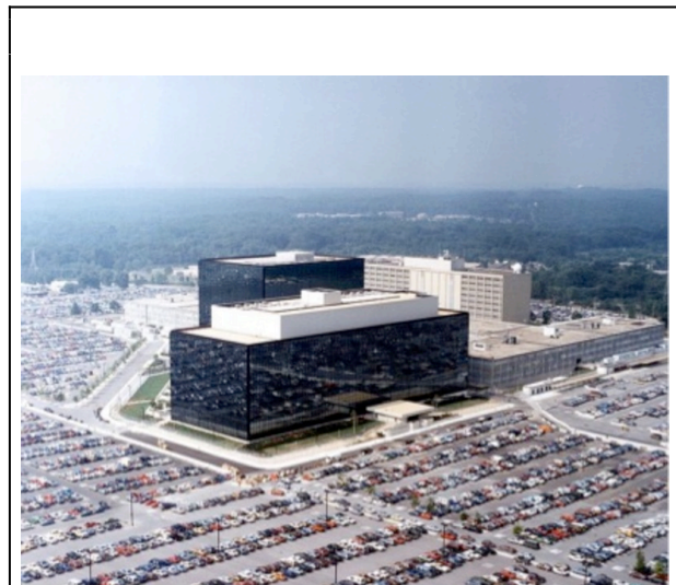
National Security Agency Headquarters, Fort Meade, Md

information the US government labels secret. 19 Why were these two young men selected to serve as guardians of the American “government of secrets?” The answer is that the body of information classified by the U.S. government is so vast that a huge army of operatives must access this “secret” information in order to do their jobs every day. According to the annual report of the U.S. Director of National Intelligence, more than four million people hold a security clearance that enables them to view classified information. 20 Among them, an astounding 1.4 million hold the “Top Secret” clearance, just like Manning and Snowden did.