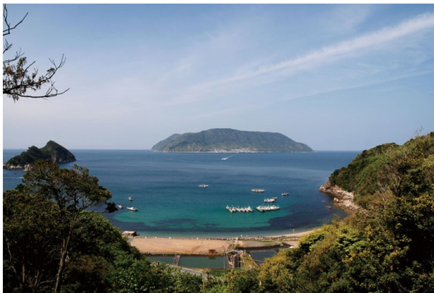
Iwaisima, the focal point of Ashes to Honey

What we see in Sweden and in the places I filmed for Ashes to Honey are not the actions of a centralized state but rather humble struggles on the part of people living in small towns and villages to bring about, on the strength of their own actions, a wholesale transformation in the way energy is produced and used. In point of fact the people of Iwaisima are up against centralized nuclear energy policies that rob them of their right to self-determination. Although whether or not to build a nuclear power plant is something that people who live there should be able to decide by themselves, they're left with no say in the matter whatsoever. So it's in places like this that the change must begin.