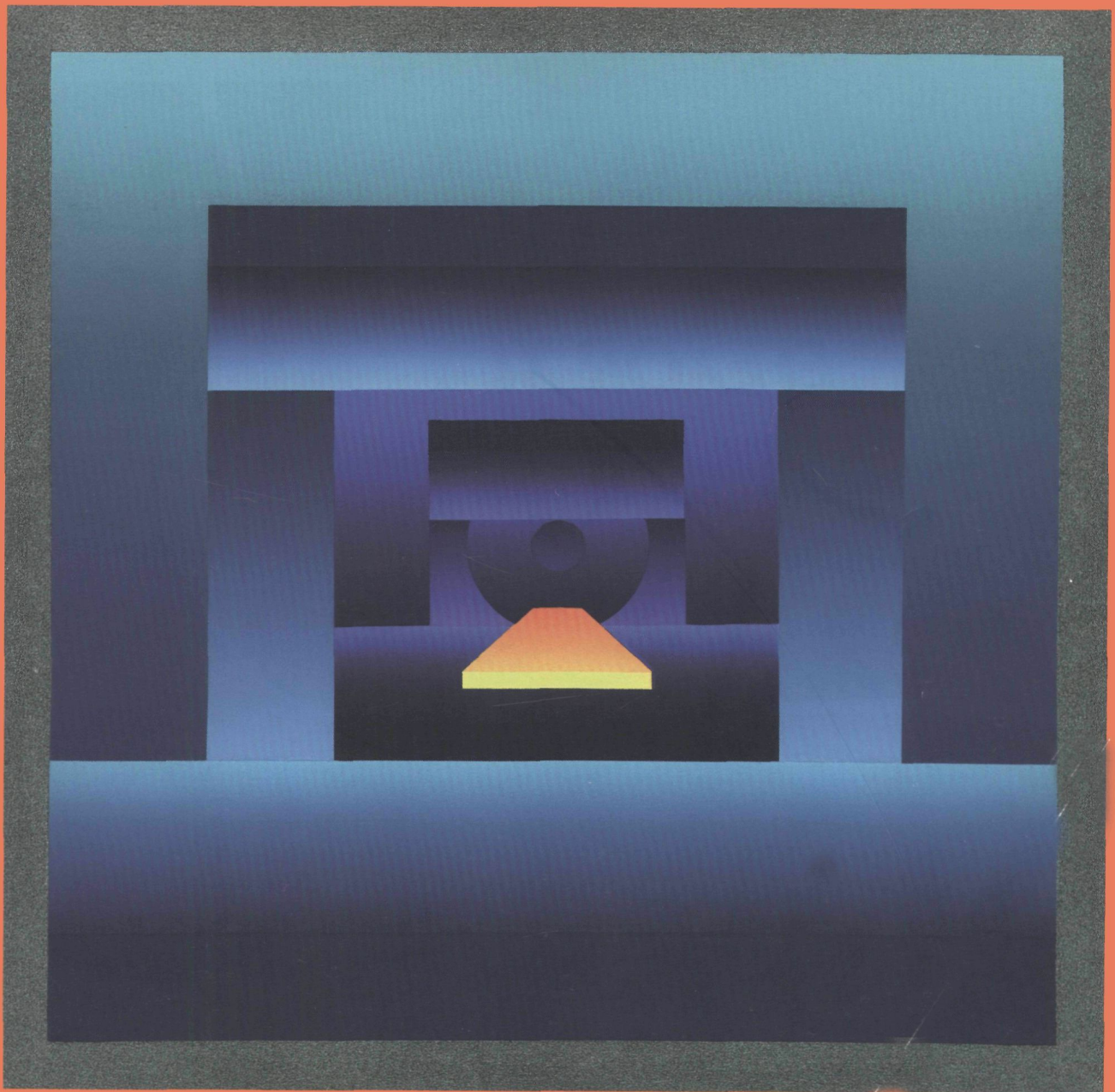
'Transition in Blue' by Francis Tansey, 2001. Giclee print (76 x 76cm)