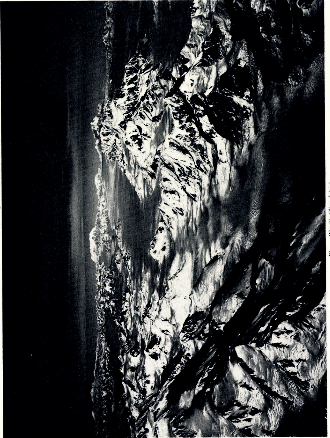
Fig. 1. The St. Elias district