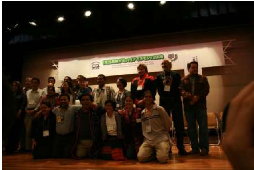
2008 Indigenous Peoples Summit, Hokkaido.

the growing trend of international society to enable indigenous peoples "to maintain honour and dignity and transmit their culture" to the next generation. 47