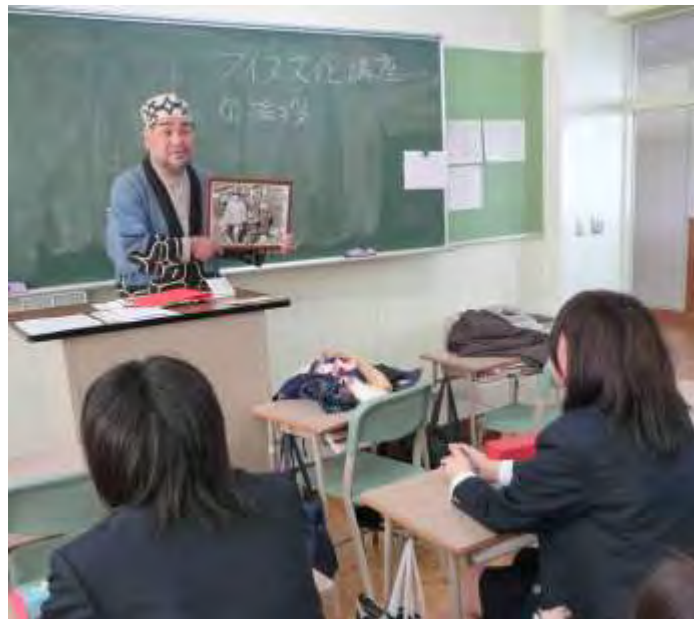
School children learn about the Ainu in Kushiro, Hokkaido

A 2009 study has noted that teachers in small schools in Hokkaido have successfully acquired knowledge of Ainu cultural practices from local inhabitants and assimilated them into their curricula in a bottom-up manner. 115 The field of education offers space for a range of Ainu negotiating positions in relation to government practices. Diene criticised the lack of a quota system to encourage Ainu entry into Japanese universities, 116 and with rates of Ainu entry to higher education low, 117 this is likely to be a direction in which Ainu activism moves.