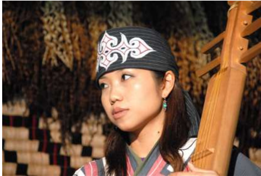
Ainu girl holding tonkari, a five-string zither.