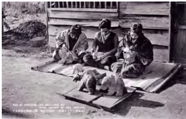
Ainu construct and engrave bear figures. Postcard, date unknown.

Its development can be seen as evidence of vitality in the face of outside pressure." 84 Comparably, Dubreuil has emphasised that the images of bears, salmon, and other forms of wild life, widely associated with Ainu culture by tourists and academics, played no part in truly traditional Ainu design, which was not figurative but repetitive with subtle variation. 85 She claims that the shift to figurative design involved a breach with Ainu religious dogma in the interests of commercial necessity, at a time when the means for sheer survival had been drastically reduced by Meiji government policy.