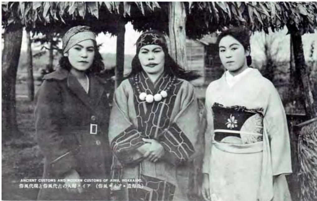
Ainu women pose in traditionally Japanese, western, and Ainu clothing. Postcard, date unknown.

Discourse on indigenous peoples tends to be a discourse of unhappiness. Most groups have experienced distressing cruelty, and narrative accounts of their struggles tend to be elegiac in tone. Japan's Ainu people have undergone suppression of their culture and livelihood, and subsequent denial of their existence. However, this article critically re-evaluates the Ainu's recent history in terms of their considerable achievements, such as international recognition and the Japanese government's 2008 declaration recognising their indigenous status. In spite of and often in reaction to continuing obstacles, the Ainu have successfully used international fora to advance towards their domestic goals. Simultaneously, they have often reshaped their culture to successfully engage with contemporary demands.