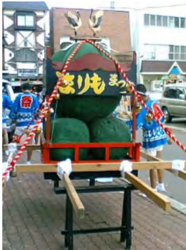
School children with Marimo Shrine.