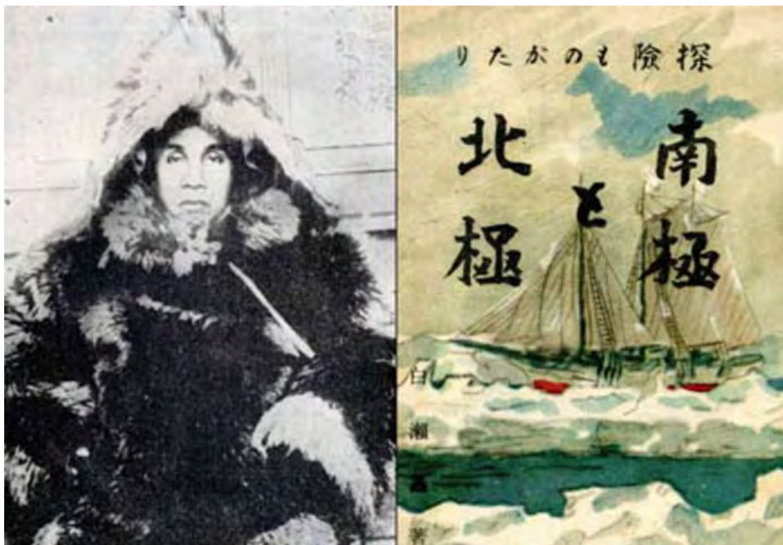
Shirase Nobuo and the Antarctic Expedition of 1912