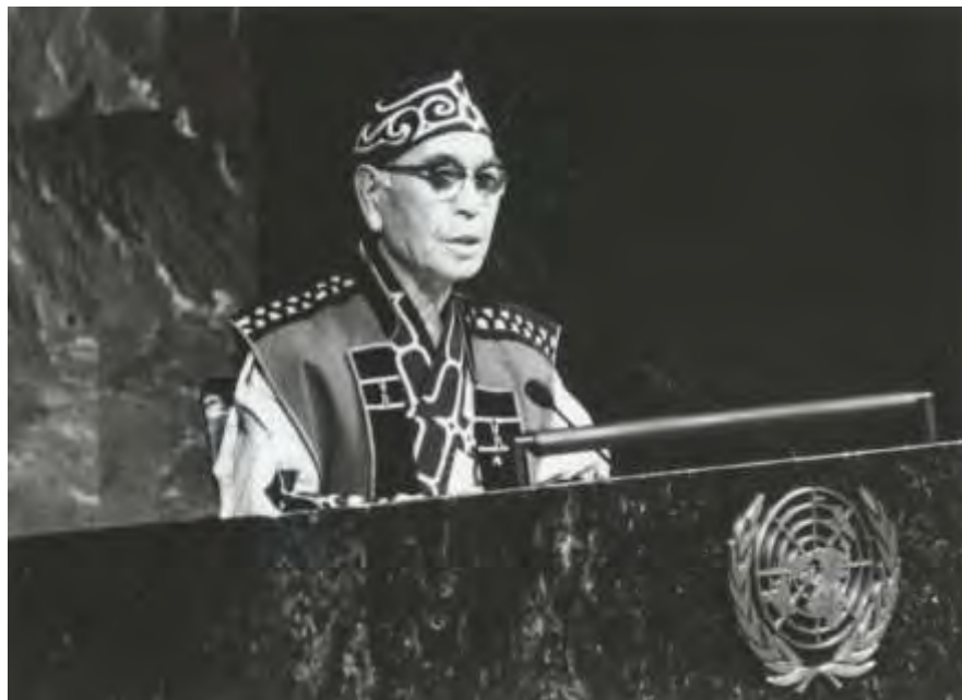
Nomura Giichi addressing the UN General Assembly in 1992