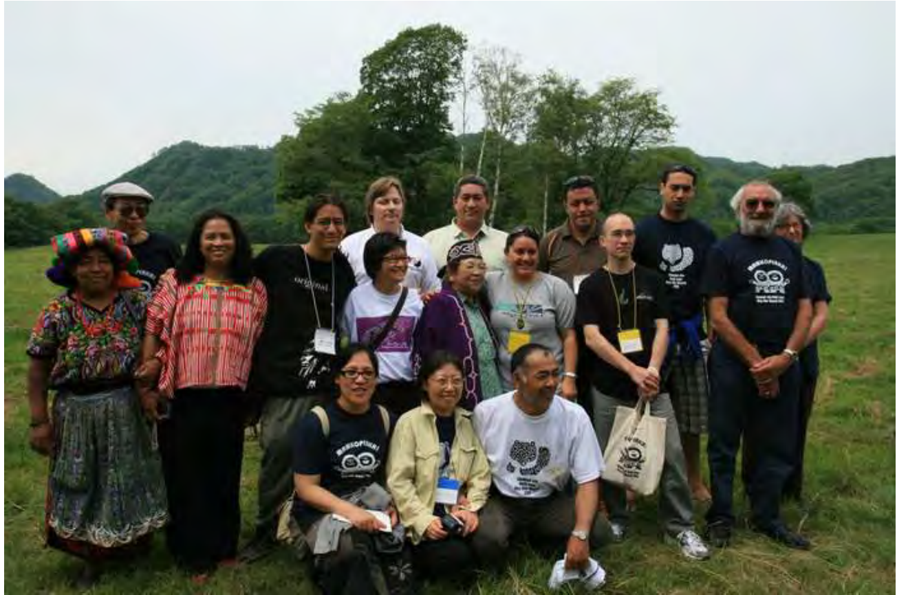
2008 Indigenous Peoples Summit.