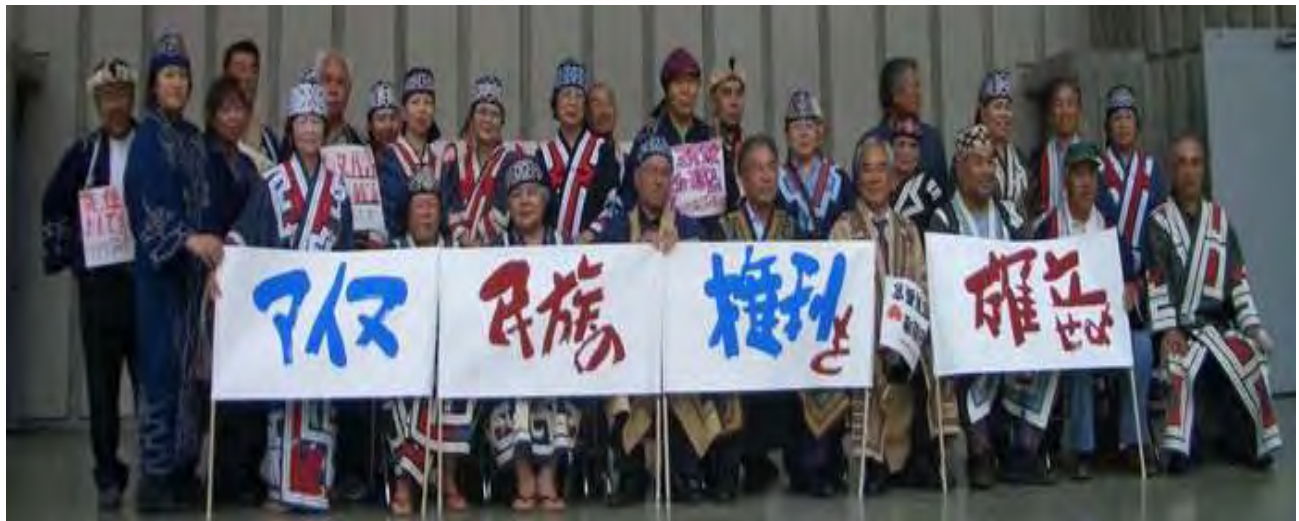
An Ainu protest, one month before the government's June 2008 proclamation, says "Establish the Rights of the Ainu People."

and called on the government to acknowledge their existence and the history of their forced assimilation. Nakasone's 1986 comments provoked outrage which led to an activists' march on Tokyo 24 and a new AAH movement immediately followed. 25 While 1997's Ainu Cultural Promotion Act (ACPA) and the government's 2008 proclamation should not be viewed as unqualified or climactic successes, the two events do represent very significant success for the Ainu as steps along paths of political and cultural resistance. The ACPA superseded the 1899 Former Aborigines Act and created a foundation to promote Ainu culture. The "Resolution calling for the Recognition of the Ainu People as an Indigenous People of Japan" on 6 th June 2008, was passed unanimously by both house of the Japanese Diet, and represented the attainment of a goal, long sought by Ainu people across Japan. 26 Neither event would have been possible without Ainu agency, working in domestic and international political arenas and developing a flexible profile of their own culture and identity.