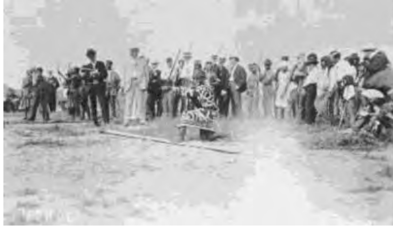
Ainu compete in archery contest at 1904 Anthropology Days, from Celebrating the Louisiana Purchase

After 1945, the government used Hokkaido to relocate Japanese coming back from the colonies 15 and, as a consequence, the Ainu's demographic profile within northern Japan and the country as a whole became even smaller. Newspaper headlines branded the Ainu a dying race - "Five Ainu left in Hokkaido" (1956), "Now only Four Ainu" (1958), "Only One Ainu in Japan" (1964). 16 The publicity led to a growth of interest in ethnic tourism and visitors came to Hokkaido looking for the last of the Ainu. 17 Then, in 1986, Prime Minister Nakasone famously remarked that there were "no minorities" in Japan.