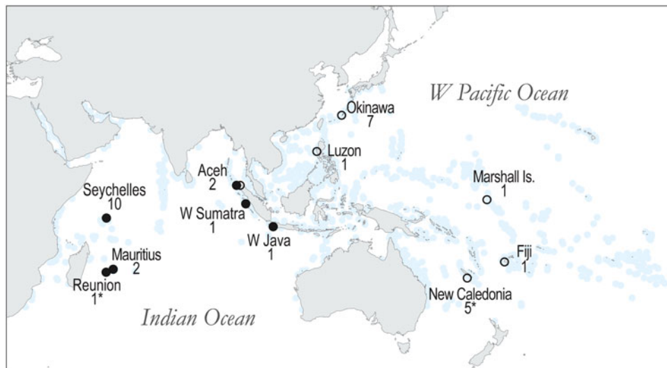
Figure 1. Map of the Indo-West Pacific showing the occurrence points of the material examined for the present study including material reported previously (Borsa et al. , 2013; Miki et al. , 2014; Chen and Borsa, 2020), including: Gymnocranius indicus sp. nov. (solid circles) and G. superciliosus (open circles). Asterisks (*) indicate type localities; numbers indicate sample sizes per locality; light-blue spots represent coral reefs. See Table 1 for additional details.

patterns in fish guides from the Western Indian Ocean or from the East Indian Ocean (Smith and Smith, 1963; Kyushin, 1977; Randall, 1992, 1995; Allen and Erdmann, 2012). An exception we found is the recently updated edition of Gloerfelt-Tarp and Kailola's compendium of trawled fishes of the northwestern Australia – southern Indonesia region. This guide includes a picture of a 195-mm long individual of this species (labelled ' Gymnocranius sp.') captured off Tanah Bala Island off West Sumatra (Gloerfelt-Tarp and Kailola, 2022). A photograph of this species was published (as ' G. griseus ') in the IFREMER online identification sheets of marine species (Evano, 2016). Another photograph was published (as ' G. microdon ') in the fishIDER identification sheets for the commercial fishes of Indonesia (Proctor et al. , 2018; O'Neill et al. , 2023). This species was again reported (as G. cf. superciliosus ) in the 'Sous les mers' online identification sheets for scuba divers at Reunion Island (Schilling, 2018). Another underwater picture of an individual of this species, erroneously labelled ' Gymnocranius microdon ', from off Utende, Tanzania in July 2021 has recently been posted in the iNaturalist community forum ( https://forum.inaturalist.org/ ; page consulted 15 October 2023).