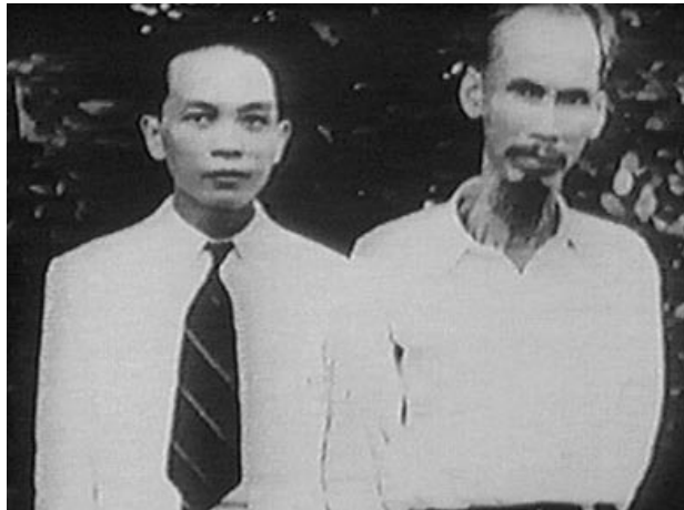
Vo Nguyen Giap and Ho Chi Minh

The asymmetry of their forces with Nato's may be even greater than with the respective sides in Vietnam (even if the alliance pleads shortages of helicopters and other equipment). Yet the recent experience of the anti-Soviet struggle, the emergence of a new generation of military commanders, and - perhaps above all - the mobilisation of centuries-old memories of opposition to foreign occupations, are potent weapons in the Taliban armoury.