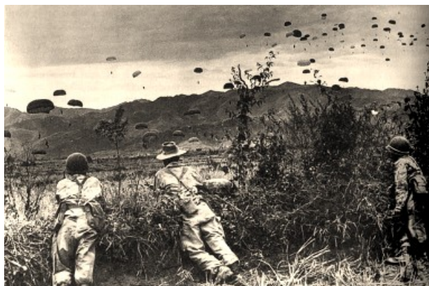
French airborne assault to defend Dien Bien Phu

It was a move too far. The French did not have the resources to supply Dien Bien Phu by air; the Vietminh controlled the access routes, and mounted an epic effort to transfer supplies (a huge amount of them by bicycle) across densely forested and mountainous tracks to encircle and besiege the French forces.