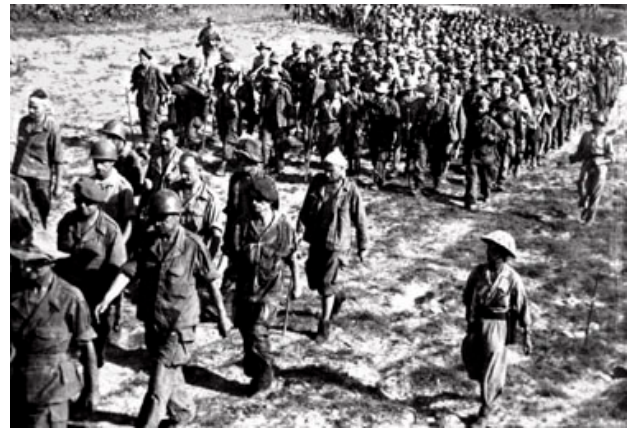
French forces surrender at Dien Bien Phu

French gave up in the face not just of "external" pressure and setback but of an "inner" corrosion of their resolve.