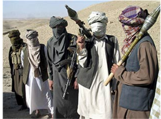
Taliban forces in Afghanistan

reflects an intelligent recognition that deaths on this scale "are a boost for the Taliban when fighters recruited from the local population are killed, as the dead insurgent's family then feels a debt of honour to take up arms against British soldiers." The assessment, put bluntly, is that killing Taliban makes even more enemies.