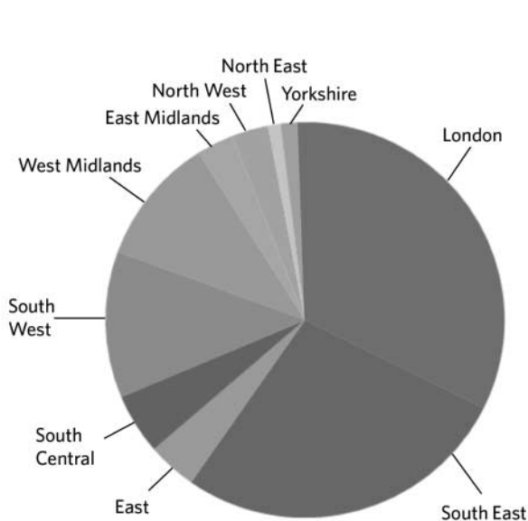
Fig 1 Overall number of referrals from each of the ten regions in 2011/2012.

It can be seen that London and the South East still refer more patients than other areas, with the North West, North East and Yorkshire/Humber having the lowest rate of referrals per head of population. The ten referring authorities were divided into four zones depending on the distance from London (Appendix 2). The number of patients as a percentage of referrals from that zone treated in each way is shown in Fig. 4. Owing to the smaller number of patients treated from Zones 3 and 4 this is shown as a percentage of total referrals.