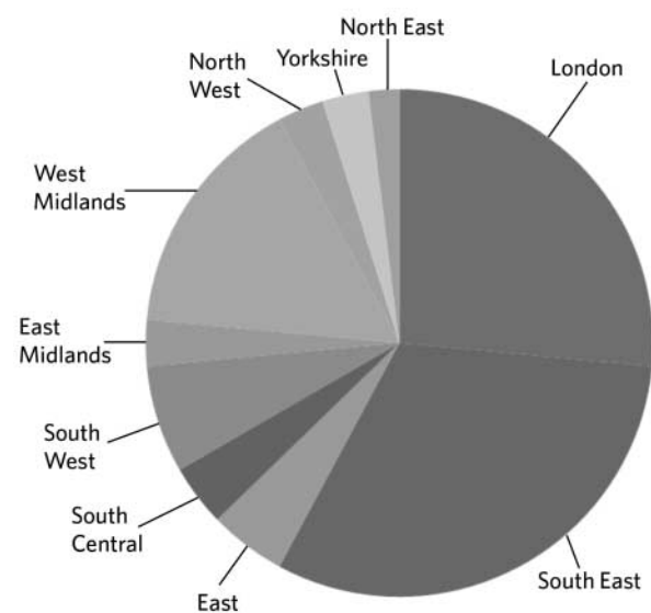
Fig 2 Overall number of referrals from each of the ten regions excluding those treated as out-patients but including those treated by home-based therapy.

Examining those treated with out-patient or home-based therapy, it was found that out-patient treatment was more likely to be offered to patients nearer to London (chi-squared test, P < 0.0009 ). Home-based therapy is not related to distance from London (chi-squared test, P = 0.3220 ), although there remains an overall lack of referrals from the North of England. For all patients treated by the service as out-patients or by home-based treatment, the average number of hours (excluding assessment) is 17.7 h per patient (range 1–55, s.d.=11). When number of out-patient and home-based treatment hours was compared for geographical distance from