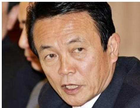
Aso Taro: Japan's future leader?

Japan the Tremendous , a bestseller written in a populist tone, highlights the peaceful nature of postwar Japan and calls the country a "fount of moral lessons" for Asia. Arc of Freedom and Prosperity: Japan's Expanding Diplomatic Horizons expatiates on Aso's tenure as foreign minister from October 2005 to August 2007.