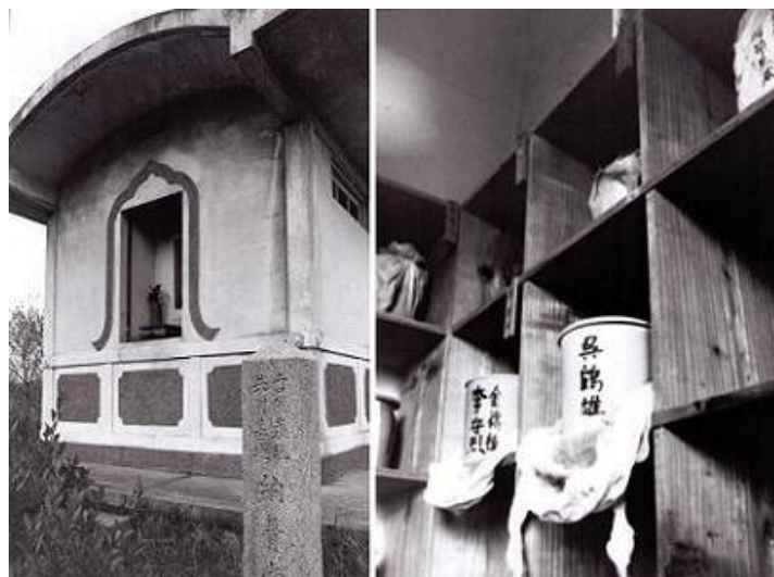
1975 images of the exterior and interior of the Aso Yoshikuma charnel house. Six containers of Korean ashes (right) disappeared the following year.

By 1976, however, all six sets of Korean remains had been removed from the charnel house shelves. Hayashi was shown a small hole beneath the shelves and told by the Buddhist priest in charge that the Korean remains had been deposited in an underground storage area. The unusual funerary practice was not further explained.