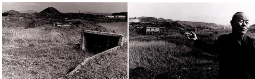
Aso Mining's former Akasaka mine in the late 1970s and a Korean forced to work there during World War II.

"The corporations' survey of remains has been insincere," the South Korean official said. "It is also strange that the family company of the foreign minister, who should be setting an example, has provided no information whatsoever." [2]