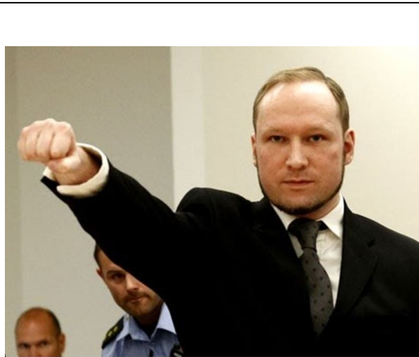
Breivik in Oslo courtroom after sentencing.

continue to make Japan's public anxious and angry. Those public responses may seem inevitable, but they are as much a product of the media penchant for peddling fear and fury—and of political leaders' priorities—as they are “natural” human reactions. As Mori Tatsuya recently reported, reality is constructed quite differently in Norway, where Anders Behring Breivik killed 77 people in July 2011 before being sentenced to 21 years in prison in August 2012. 34