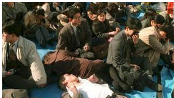
The scene outside a Tokyo subway after the sarin gas attack of March 20, 1995, which killed 13 and injured 6300.