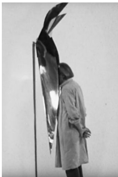
Figure 6. Jacques Barsac, Sculptures Sonores Baschet , 1982, performance by Bernard Baschet. Bernard et François Baschet © ADAGP 2024.

autists and children with special educational needs. Towards the end of the 1970s, the Baschet Educational Instrumentarium was created for educational purposes to propose a broad sound palette accessible to children. Bernard Baschet stated: ‘In the visual arts, we give children colours to be creative, but we don’t do that for sound. That is why I wanted to create a “palette of sounds!”’ ( Structures Sonores Baschet n.d.b). The aim was to develop perception and sensory connection, thus improving cognitive function and language playfully without requiring music knowledge.