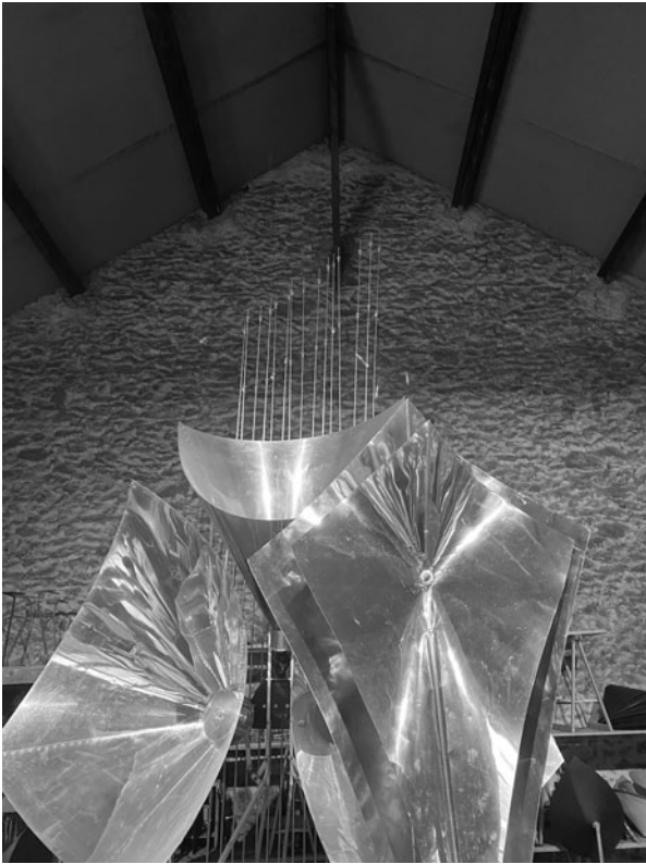
Figure 1. A series of Baschet sound sculptures with the Voice Leaf situated at the front right. Structures Sonores Baschet Association, Saint-Michel-sur-Orge, France, 2022.

Bernard Baschet trained at the École Centrale de Paris before joining the Groupe de Recherches Musicales (GRM) at Maison de La Radio circa 1965, working alongside Pierre Schaeffer on his Treatise on Musical Objects: An Essay across Disciplines (Structures Sonores Lasry-Baschet 1978: 2; Schaeffer [1966] 2017). 2 The Baschet brothers, who conceived their first series of assembled sound sculptures in the mid-1950s, complemented one another in terms of skill sets, as Bernard observed in his essay ‘Structures Sonores’: