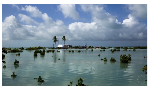
Map of Oceania and Oceanian Countries Kiribati: A Nation Going Under

PACOM is also partnered on climate-change adaptation with larger regional players such as Australia, including a 6-month rotational deployment of Marines to the northern area of