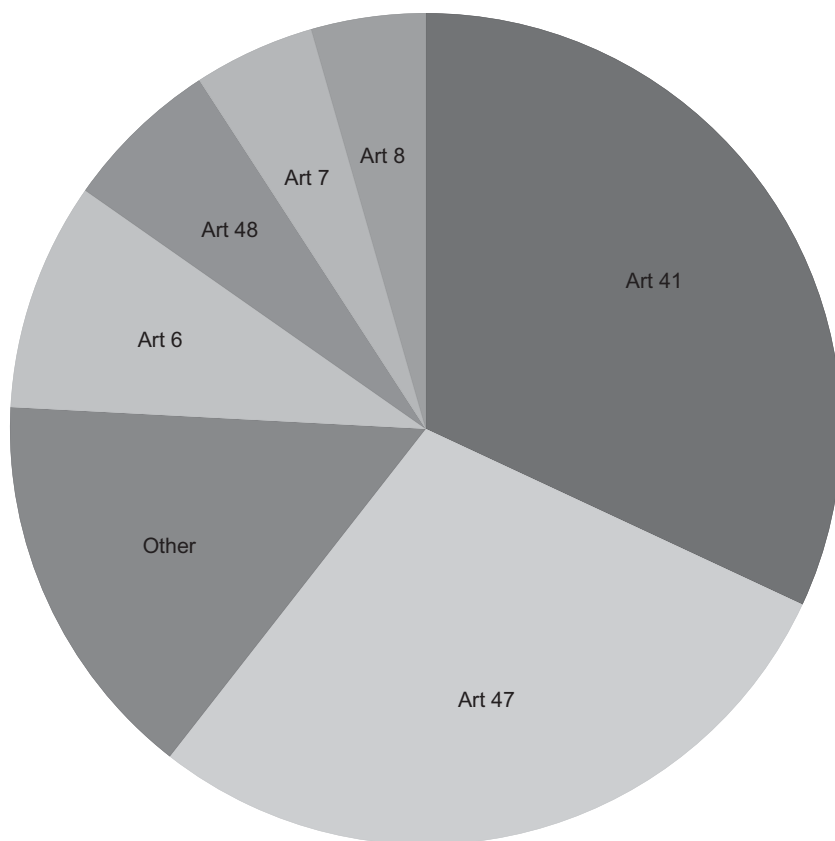
FIGURE 2.2 Charter rights in successful damages cases (1)

life), Article 8 (Protection of personal data), Article 21 (Non-discrimination), Article 16 (Freedom to conduct a business), and Article 17 (Right to property). 47 These are all fundamental rights that can effectively be claimed and enforced vis-à-vis the EU, by virtue of the EU's nature as a non-state actor and by virtue of the nature of the rights involved (Figures 2.2 and 2.3).