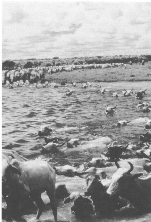
Cattle being herded from flooded lowland sections of a ranch to upland areas. The seasonal patterns of flooding govern much of the activities on the ranches.

The llanos of Venezuela are a large low-lying savannah region that contain much of the northern and western regions of the Orinoco River drainage and cover an area of approximately 250,000 sq km. Together with the Colombian llanos (250,000 sq km), they comprise the largest, uninterrupted area of neotropical savannah north of the equator (Sarmiento, 1984). The llanos are influenced by a well defined wet season from May to November and a dry season from December to April. The extreme seasonality of rainfall, low-lying topography, and relatively impermeable soil combine to cause widespread flooding from June to October. During the extended dry season, aquatic habitats are reduced to small lagoons, pools in seasonal