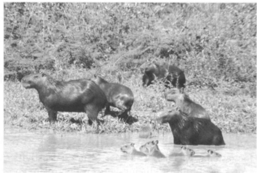
The caiman (left) and the capybara (right) – species for which appropriate management would protect natural habitats and the wildlife associated with these areas.

apparently arbitrary changes in regulations. Such changes make it very difficult for ranch owners to plan for the economic health of their ranches. Finally, because the system we outline is based on economic incentives, there is a need for economic, political and security stability in Venezuela in general and in the llanos in particular. In the past, problems with kidnappings and unrest associated with drug trafficking has had enormous consequences for the Venezuelan cattle industry. Many landowners have been willing to sell their properties at low prices because of fear of unrest.