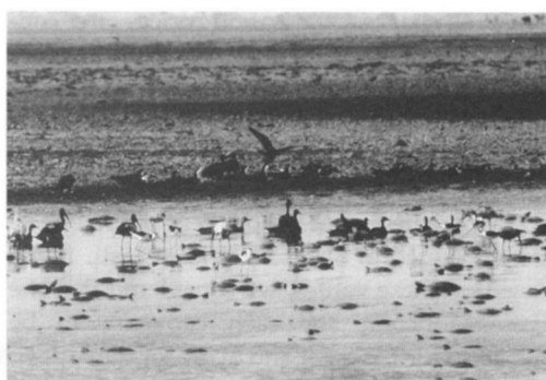
The Venezuelan llanos at the height of the rainy season (left) and in the dry season (R. Hoogesteijn).

restricted to the proximity of rivers and lagoons (Ojasti, 1991). Of the remaining South American ungulates, only deer (white-tailed deer Odocoileus virginianus , pampas deer Ozotocerus bezoarticus , and swamp deer Blastocerus dichotomus ) can be regarded as major components of the llanos ecosystem, but they seem unable to maintain population levels high enough to be a major force in ecosystem dynamics (Ojasti, 1983). This natural scarcity of large herbivores has been an important factor permitting cattle to exploit these grasslands.