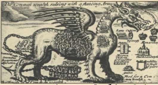
From Refiguring Revolutions