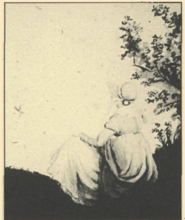
From Jane Austen

— Washington Post Book World $19.95 paper, illustrated