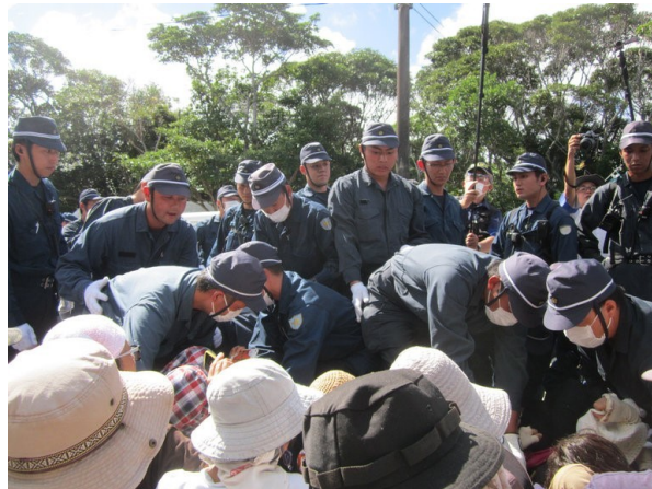
Riot Police Drag Away Protesters, Takae, Late 2016

the most part unreported in Japan proper and globally. Occasionally tears were to be seen in the eyes of younger, Okinawan riot police as they dragged away, time and again, protesters old enough to be their parents, or even grandparents, trying not to heed their pleas. Increasingly, riot police with no connection to the prefecture were sent in against the protesters for this reason.