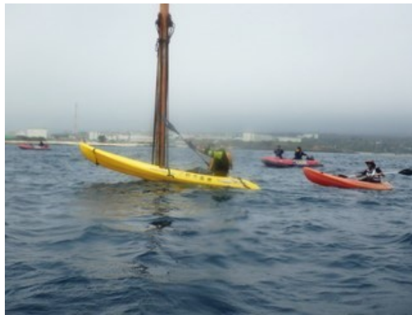
Part of the Canoe/Kayak Protest Flotilla, April 2016