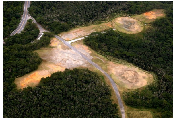
Gouged Forest and Completed “Osprey Pads”