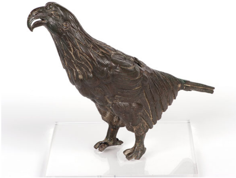
FIG 2. Bronze Eagle found at Silchester, now in Reading Museum.

‘Generations of Roman or British landlords must have lived . . . where the first owner had erected the house in sheltered and ideal surroundings . . . some ten miles from Chichester’ may have influenced Sutcliff’s decision to have Marcus found the family farm on the South Downs at the end of The Eagle of the Ninth , but she later denied that Bignor was the archetype. Instead, she was inspired by the ‘Roman bits and pieces all over the Downs and the Weald’, although she could imagine Marcus’ farm being discovered one day ‘a dozen or so miles northeast of Porchester’. 32 It would also seem that there was no single inspiration behind the famous dolphin ring, as there are no known emeralds decorated with a dolphin motif from Roman Britain. However, dolphins do frequently appear on intaglios found in Roman Britain, with an illustration of one present in Wheeler’s London in Roman Times (FIG. 3), whose work, as noted above, Sutcliff was acquainted with. 33