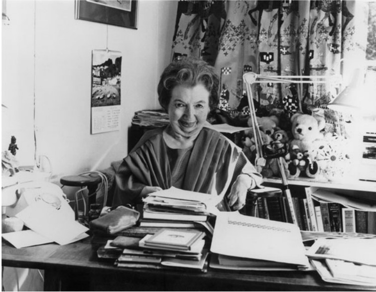
FIG 1. Portrait of Rosemary Sutcliff by Mark Gerson.

stand-alone novels such as Outcast (1955), Mark of the Horse Lord (1965) and the retelling of the Boudiccan Revolt, Song for a Dark Queen (1978). The Capricorn Bracelet (1973) is a collection of short stories following several generations of a family living in Roman Britain, while her other short stories, including The Bridge Builders (1959a), A Cirlet of Oak Leaves (1968), Eagle's Egg (1981) and The Hundredth Feather (1984), appeared in multi-authored anthologies. The protagonists of Sutcliff's stories sometimes play a role in major historical events, particularly battles, and encounter famous individuals, including the emperors Carausius, Allectus, Constantius Chlorus and Constans, Queen Boudicca, the governor Agricola and Aurelius Ambrosianus.