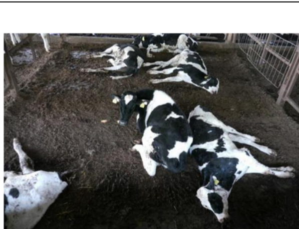
Starving cows in Fukushima

When I considered Chisso as offender, I thought that I had nothing to do with it. I thought that it was just a company, with power in the system. But when I began to perceive myself as 'another Chisso', I experienced a sense of crisis that I myself was moving away from the connectedness of life. 63