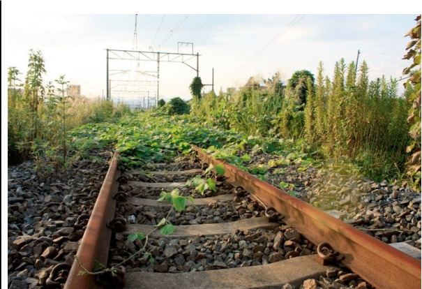
Namie became a ghost town

The crisis in Fukushima is even more serious in many respects. In Fukushima, the level of devastation is extremely high, and as at August 2012, approximately 111,000 people have been forced to evacuate by the government with no or limited prospects of returning to their homes. 35 The impact of the nuclear crisis is global rather than regional, and in respect of the ecosystem, it is not yet possible to determine its ultimate impact. The underlying power structure of the Japanese 'nuclear village' is more formidable than that of Chisso. Its power is reinforced by close links to the international nuclear regime. The causal link between exposure to the poison and illness is much harder to establish in the case of irradiation: low level irradiation does not result in distinctive symptoms as in Minamata disease; it takes many years to manifest as cancer, the cause of which is difficult to single out; and impact upon the unborn, infants and young children is unknown.