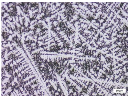
Figure 2. Microstructure of HEA2