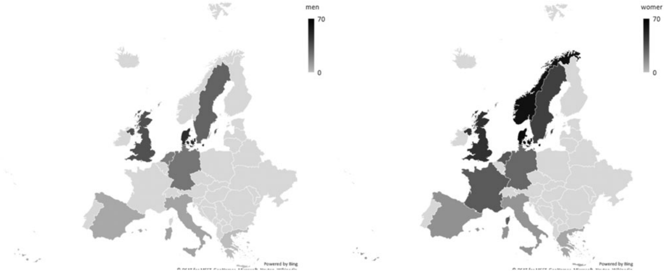
Fig. 1. Prevalence of any type of dietary supplement in European Prospective Investigation into Cancer-Europe as assessed by 24-h recall (31) . Data collection of the calibration study between 1995 and 2000.