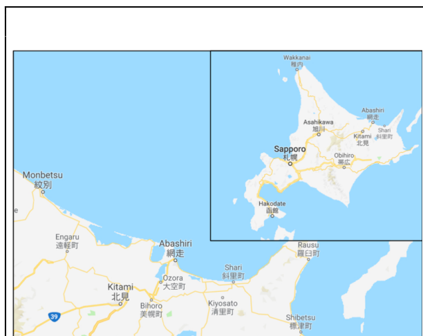
Figure 1: Hokkaido and Okhotsk Subprefecture (Google Maps)

celebrate the centennial of the Meiji Restoration in 1968, residents in Abashiri and other places in the Okhotsk Subprefecture ( Ohōtsuku sōgō shinkō kyoku オホーツク総合振興局) of Hokkaido (see Figure 1) began to take an increasingly critical view of the government's purported achievements in modernization and industrialization since the Meiji period. Many citizens in Abashiri were particularly concerned about the Abashiri Prison's history and the use of convict labor ( shūjin rōdō 囚人労働) during the construction of the Central Road ( chūō dōro 中央道路) from 1887 to 1891.