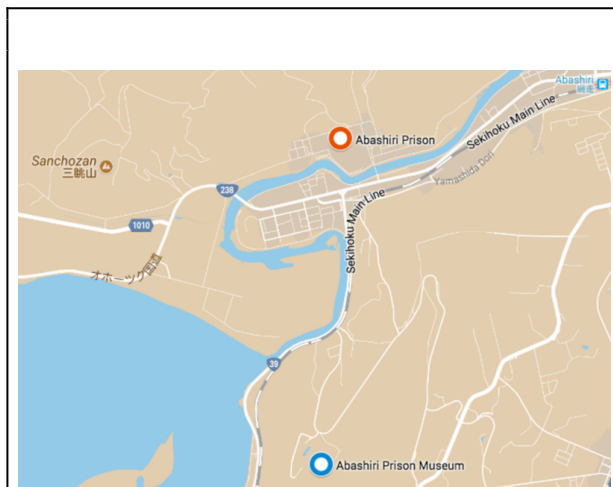
Figure 3: The location of the Abashiri Prison and the Abashiri Prison Museum (Google Maps)

Prison Preservation Foundation. Their efforts to save the prison were ultimately successful. They moved the original structures near Mount Tonto, across the Abashiri River (see Figure 2) and turned the group of prison buildings into a museum. The Abashiri Prison Museum opened to the public in 1983. 67