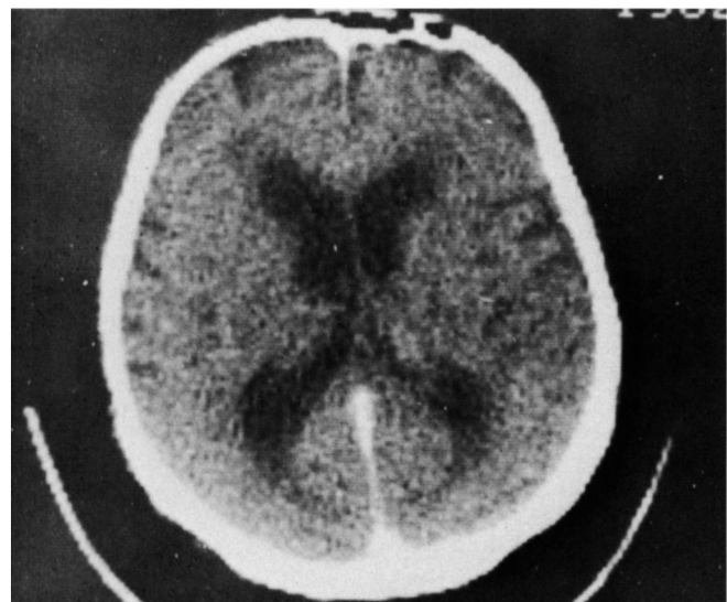
Figure 2 — CT-scan: Dilatation of the lateral ventricles and some degree of cortical atrophy, best shown over the fronto-temporal areas with enlargement of the cortical and inter-hemispheric sulci.

An ^{111}\text{In} -DTPA isotope cisternogram revealed abnormal flow of CSF with early penetration of the ventricles, but with some stasis in the cisterna magna. More importantly there was poor resorption along the superior longitudinal sinus (fig. 3). The total body ^{32}\text{P} bone scan showed increasing uptake only over the skull, consistent with active Paget's disease.