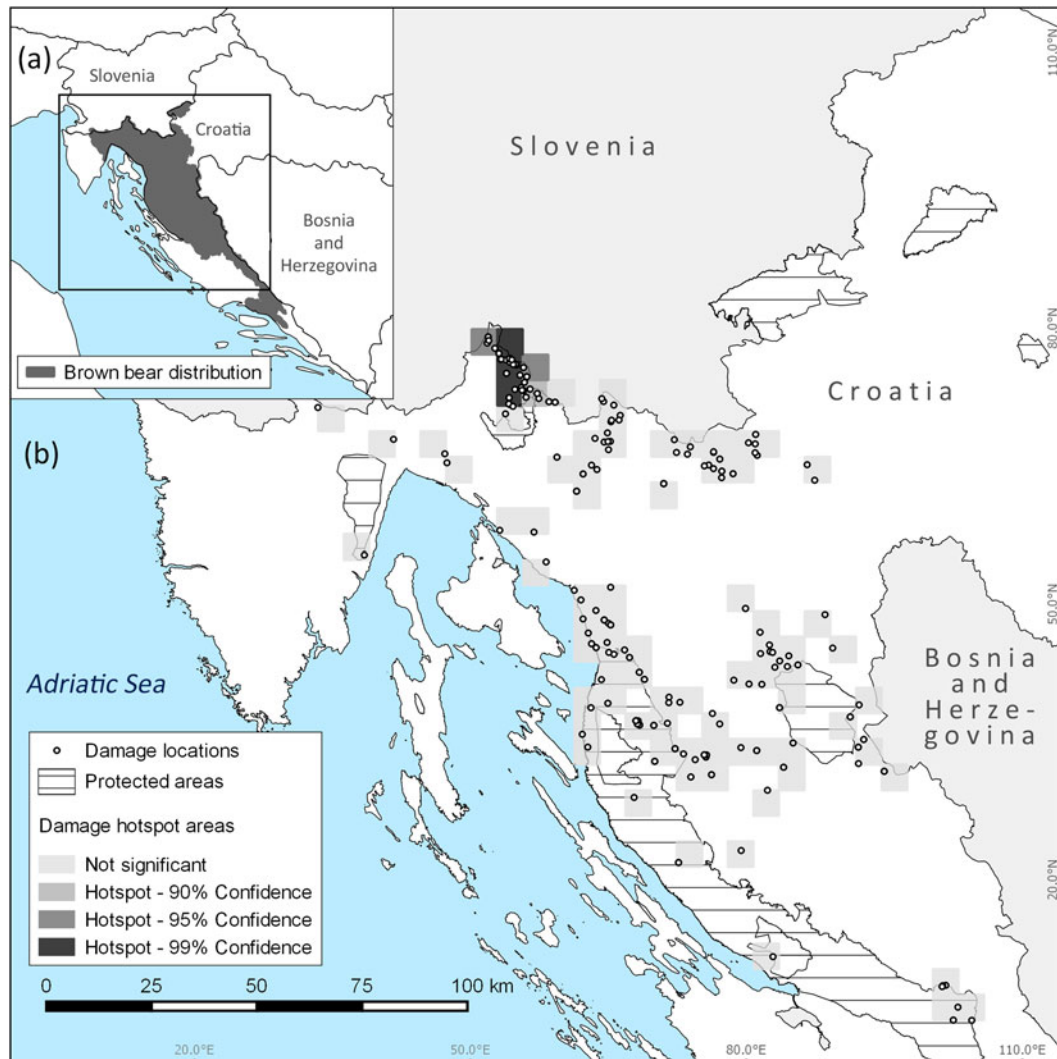
FIG. 2 Brown bear distribution (a) and damage claim locations and hotspots (b) in Croatia for 2004–2014.

landscape protection status and bear population characteristics hypotheses, respectively (Table 2; Supplementary Material 1). The hybrid hypothesis models had lower AICc values (1276.9–1278.9), with a minimum \Delta AICc of 4.7 for the lowest model for the other hypotheses, and thus had the highest support. Of the models built for this hypothesis, two were the most parsimonious, having \Delta AICc < 2 (Table 2). However, the \Delta AICc values of the second-best model were close to the threshold of 2: the difference is because the best model has one variable less (see AICc formula in Burnham & Anderson, 2002). Model averaging is less appropriate in such situations and the most parsimonious model should be selected (Banner & Higgs, 2017). For the three variables included in the best models of the hybrid hypothesis, the 95% confidence interval did not include zero, so it is possible to determine whether their effect on the dependent value is positive or negative. Distance to the nearest protected area had a negative effect on the number of bear damage events per km 2 , whereas the number of villages and