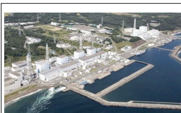
Fukushima Daiichi by the sea

releases from the plant amounted to 36 PBq, 80 percent of which were deposited in the water.