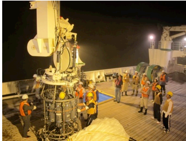
The TUMSAT team preparing to collect samples aboard the Umitaka Maru during a survey mission outside the exclusion zone in July 2011 (Miguel Quintana)

radioactive cesium per kilogram (Bq/kg), while more than half of the 30 spots surveyed inside the perimeter topped 500 Bq/kg (publication of these figures is still pending).