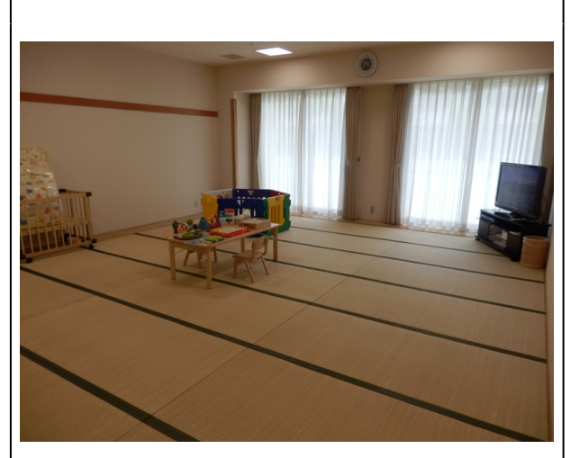
Daycare facility that opened in the summer of 2013 at the Ajinomoto National Training Center in Tokyo (photo by author, July 2013)

Brill, 2011). Her research focuses on the intersections between sports and society in modern and contemporary Japan.