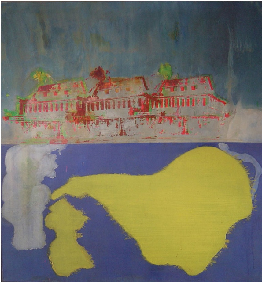
Figure 1. Frank Bowling, Mother's House (1967), acrylic on canvas, 157.5 × 167.6 cm.

were British artists with American popular culture that often commentators have needed to remind gallery-goers of the sequence in which interest in pop grew. Brauer et al. write of pop's transatlantic historiography,