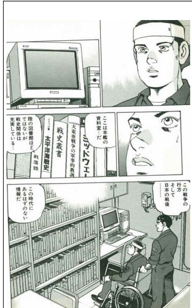
Image no. 3. [Kadomatsu takes Kusaka to the ship's library.] Jipangu vol. 1, p. 222.

Kadomatsu decides to bridge that distance by taking Kusaka to the ship's library and synchronizing him with the history of postwar Japan. 28 Instead of synchronizing him with the chronological identity of the Mirai's crew, however, the archive serves as a "Pandora's Box" for Kusaka, opening the possibility of altering the outcome of the war and the course of postwar history. 29