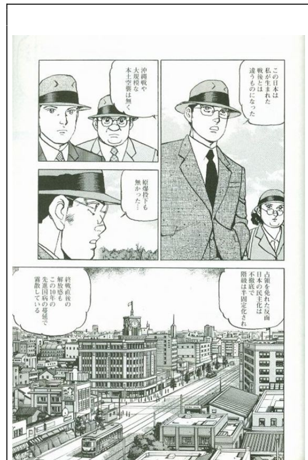
Image no. 4. [Kikuchi reflects on the future of a Japan without defeat.]

“spirit,” by pointing a gun at his head: “If you can avoid this bullet with your conviction of victory, then I will believe in the infinite capacity of the spirit.” 34 These levelheaded and sincere individuals give wartime Japan an attractive face by standing in judgment of it. Admiral Yonai Mitsumasa, former Naval Minister and Prime Minister, for example, bemoans “the childishness ( amasa ) of this country, which expects its self-satisfied sense of justice to be accepted on the diplomatic stage. And when that expectation is betrayed and it discovers the world is too complicated to be handled, it attempts to beat it into submission by force.” 35