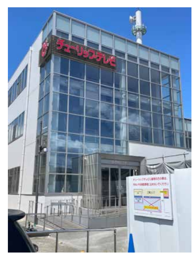
Fig. 2 Tulip TV headquarters in Toyama City.

bic, and transphobic backlash propelled by cooperation between the UC and politicians did not receive major media attention.<sup>9</sup>