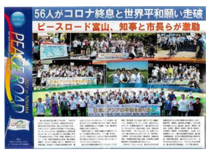
Fig. 4 The front page of a Peace Road Toyama pamphlet introduces its bike-riding event: "Peace Road Toyama, cheered by the governor and mayors" (image used with permission from Kamono Mamoru).

Later in July, Toyama stations reported on how the UC offered Toyama politicians electoral support. On July 21, Tulip TV interviewed thirty-two LDP members in the prefectural assembly and several municipal mayors in the prefecture (Tulip TV 2022a). It reported that Toyama Governor Nitta Hachiro, Toyama Mayor Fujii Hirohisa, Takaoka Mayor Kakuda Yūki, and four members of the Toyama Prefectural Assembly had received campaign support from the church.<sup>16</sup> On July 20, KNB reported in its early evening news show "KNB Every" that Governor Nitta had received campaign support from the UC in the 2020 gubernatorial election (KNB 2022a). Tulip TV aired further testimony on July 28 by a Toyama City Council member who had won his seat by a margin of only 237 votes. He stated that "without those