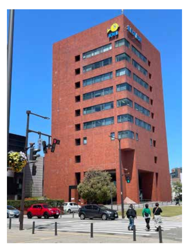
Fig. 3 KNB headquarters in Toyama City.

1930"<sup>10</sup> and TBS's "Hōdō Tokushū,"<sup>11</sup> both of which won Galaxy awards for their reports on the UC and politics in 2022, as well as TBS's late night news show "News 23" and Yomiuri TV's daytime talk show "Jōhō Raibu Miyaneya." Miyaneya's audience rating rose from 4% in June 2022 to 7% in July, when the show started its daily broadcast on the church (Shūkan Bunshun 2022c). NHK, Japan's public broadcaster, did not report in depth on UC's political involvement in late July 2022, but in late August it produced a program on "Kurōzuappu