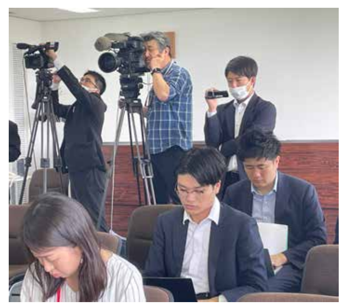
Local journalists and videographers at a press conference by the Toyama branch of the UC-related Peace Ambassadors Council after a court session in Toyama City, May 22, 2024.

On July 8, 2022, former Prime Minister Abe Shinzō was shot and killed while on a campaign tour in Nara prefecture in western Japan. The suspect, fortyone-year-old Yamagami Tetsuya, was immediately arrested. Reports on broadcast, print, and social media emphasized that Yamagami held a grudge against a "specific religious group" later revealed to be the Korea-based Unification Church (UC); its official title is the Family Federation for World Peace and Unification (FFWPU). Yamagami was motivated by Abe's connection with the UC, which he learned about via a video message the former PM delivered in September 2021 to an event hosted by a UC-related organization, the Universal Peace Federation (UPF). Media outlets reported that Yamagami's mother had made ruinously large donations to the UC, which he blamed for the downfall of his personal fortunes. Following initial media reactions to