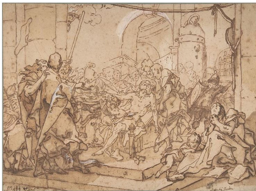
Figure 9. 'La mort de Socrate' by Michel François Dandré-Bardon, 1749, Metropolitan Museum of Art, New York. Available online: https://www.metmuseum.org/art/collection/search/343539 (accessed 1 May 2021).

Francois Boucher's painting (Figure 11) depicts a complex of figures through which Socrates can hardly be distinguished. His companions are mourning around him inside the prison cell, while some military guards can be seen in the upper right. The dense framing of Socrates by his companions indicates how dear Socrates was and that the Athenians made an irreparable mistake in condemning him to death. Some figures closest to the viewer (bottom left) are depicted in dark colours to be considered as Framing, as the Salience of the painting is the dying Socrates. The representation of Socrates as a young man is not very common and