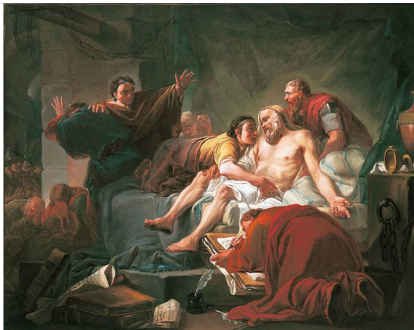
Figure 13. 'La Mort de Socrate' by Jean-Baptiste Alizard, 1762, Ecole Nationale Supérieure des Beaux-Arts, Paris. Available online: https://commons.wikimedia.org/wiki/File:Mort_de_Socrate-Alizard.jpg (accessed 1 May 2021).

Socrates is located in the Centre of the representation, the Salience of which is completed by five other figures: (a) a kneeling figure in red records the unfolding events, delivering them to eternity, (b) a young man embraces Socrates with intense emotion, (c) a companion supports him while looking at two other figures,