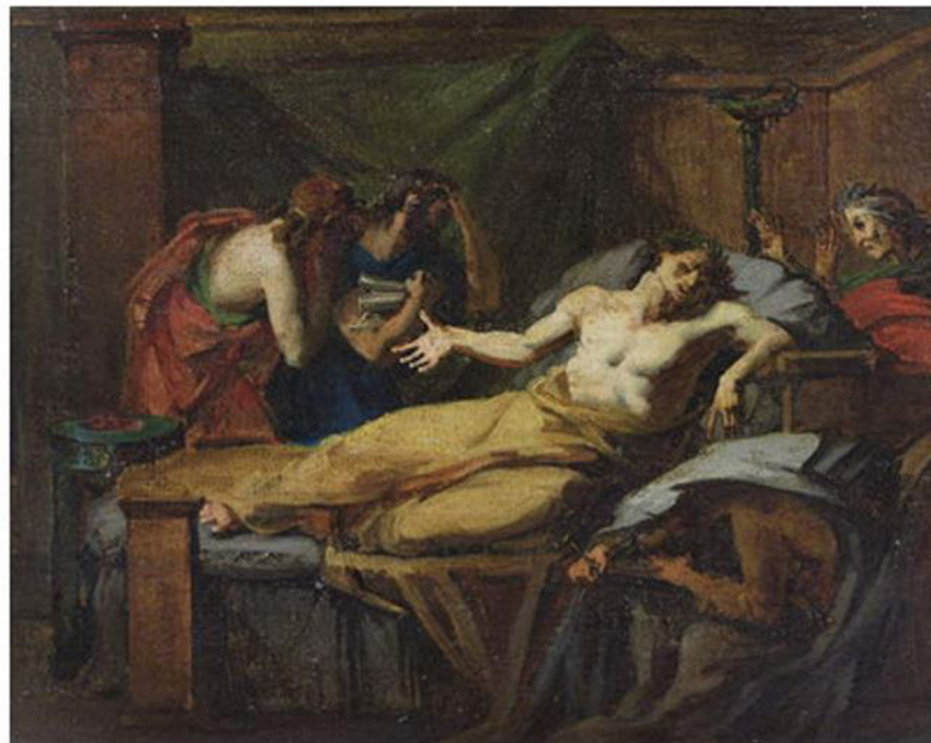
Figure 16. 'La mort de Socrate', Joseph Félix Henri Auvray, 1800, Musée des Beaux-Arts de Valenciennes, Paris. Available online: http://www.hellenicaworld.com/Art/Paintings/en/FelixAuvray.html (accessed 1 May 2021).

As a final comment, we must point out that the representations of Socrates portray a hero who put the common interest above the individual, spoke of objective morality and defended his views with his life, remaining a free spirit in the face of a tyrannical power. Socrates, as a sage and a revolutionary -although if he lived he might have abhorred such descriptions- was an ideal role model for the era of Enlightenment. After all, the radicalism of the French Revolution will project, a few years later, the model of the struggling