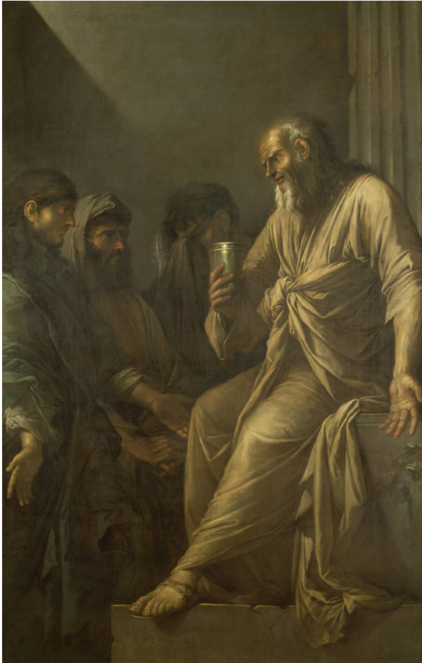
Figure 6. 'The Death of Socrates', Salvator Rosa, 17th century, private collection. Available online: https://www.meisterdrucke.it/stampe-d-arte/Salvator-Rosa/839436/La-morte-di-Socrate.html (accessed 1 May 2021).

The young man's gesture in white clothes may imply just that: no one would be watching right now (Wilson, 2007).