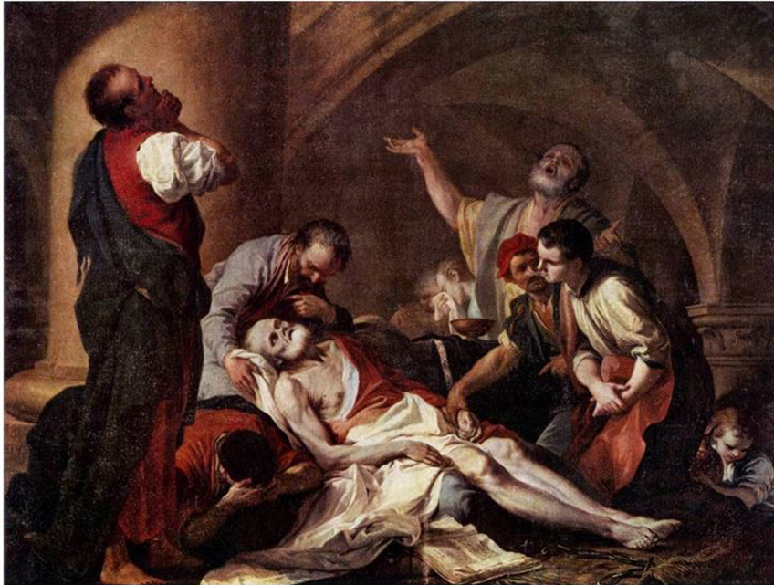
Figure 14. 'The Death of Socrates' by Giambettino Cignaroli, second half of the 18th century, Museum of Fine Arts, Boston.

one of which (d) seems hidden and crying and the other (e) hugs the previous one raising his hands in despair while, on the far left, some guards watch the scene. Once again, Socrates is presented as a person whose death has a significant impact on his environment. In this way the observer realises that this is not a conventional death, but a reminder of a transcendence.