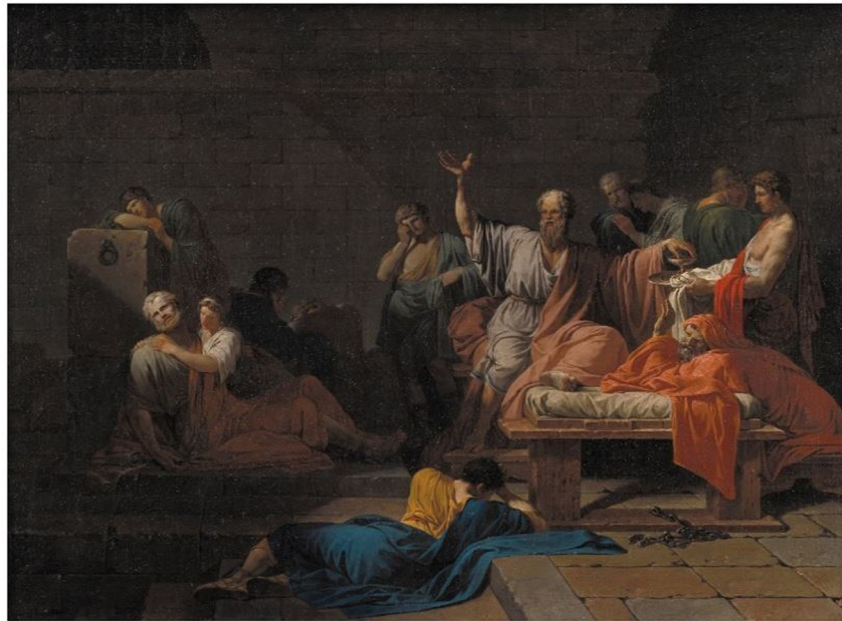
Figure 3. 'La mort de Socrate' by Jean-Francois-Pierre Peyron, 1787, Statens Museum for Kunst, Copenhagen. Available online: http://users.sch.gr/ipap/Ellinikos%20Politismos/Yliko/Theoria%20arxaia/metafraseis%20c%20gym/c9xm.htm (accessed 1 May 2021).

influenced by David (Einecke, 2001) as the lines are clearer and the space between them seem to have diminished (Figure 4).