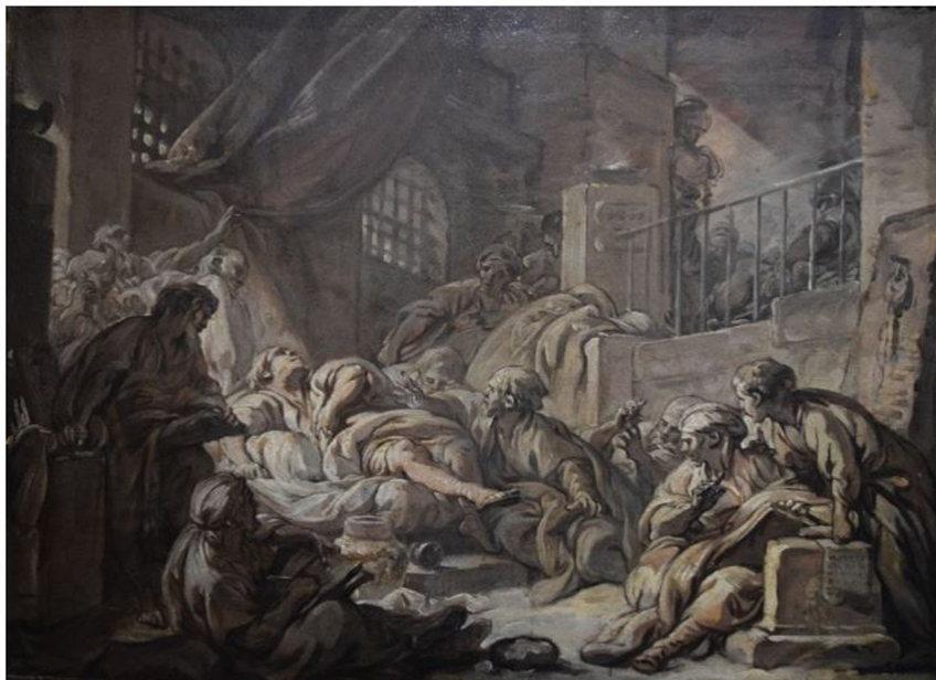
Figure 11. 'La Mort de Socrate' by Francois Boucher, 1762, Louvre, Paris, France. Available online: https://collections.louvre.fr/en/ark:/53355/cl010054818 (accessed 1 May 2021).

In this representation the fact of the imminent death of Socrates has led to the suffering of those present. Both the companions and the soldiers bow their heads and look away. The event is irreversible and Socrates with a characteristic gesture urges his companions not to mourn. The artwork focuses on the effect of Socrates' death on those around him and it seems that a 'dying' Socrates emotionally excites the observer more than an already dead Socrates 5 .