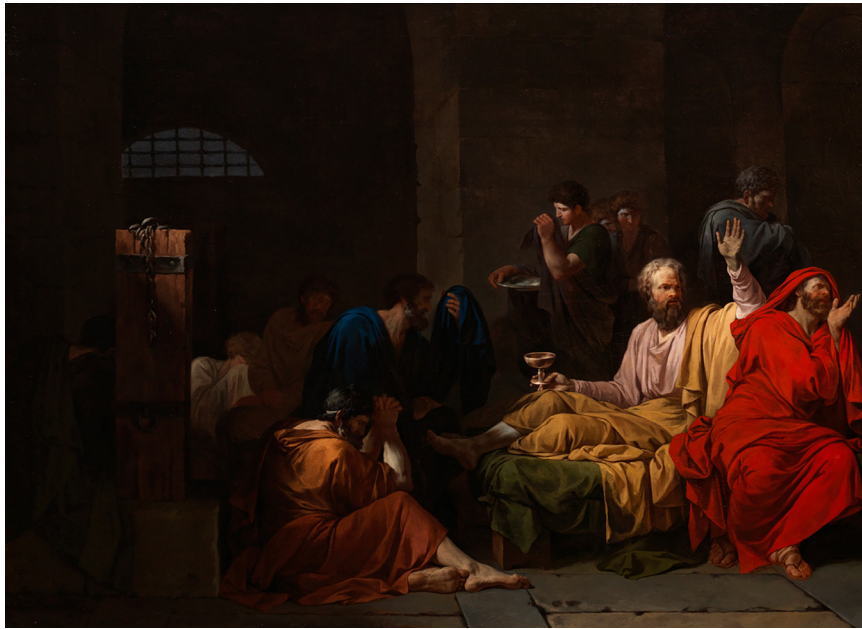
Figure 4. 'La mort de Socrate' by Jean-Francois-Pierre Peyron, 1788, Josslyn Art Museum, Omaha. Available online: https://www.joslyn.org/collections-and-exhibitions/permanent-collections/european/jean-francois-pierre-peyron-the-death-of-socrates/ (accessed 1 May 2021).

window in the background and another (implied) opening on the left.