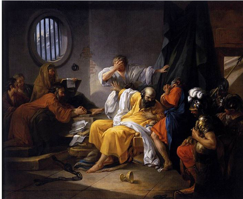
Figure 12. 'The Death of Socrates' by Jacques-Philippe Joseph de Saint-Quentin, 1762, Ecole Nationale Supérieure des Beaux-Arts, Paris. Available online: https://commons.wikimedia.org/wiki/File:Jacques-Philip-Joseph_de_Saint-Quentin_-_The_Death_of_Socrates_-_WGA20664.jpg (accessed 1 May 2021).