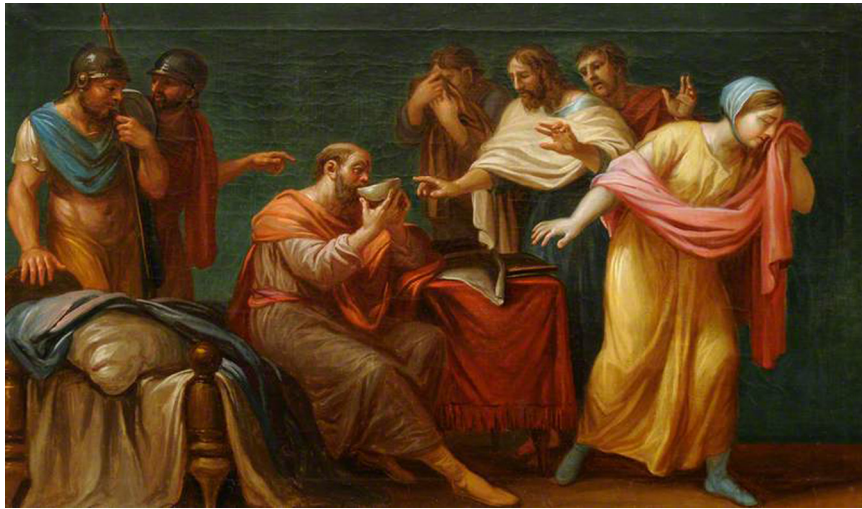
Figure 8. 'Socrates drinking the Hemlock' by Antonio Zucchi, 1767, National Trust, England. Available online: http://www.nationaltrustcollections.org.uk/object/960060.1 (accessed 1 May 2021).

depressed. This is a more human depiction of the philosopher, who has chosen not to escape and it seems that this path is painful. Socrates' gaze avoids the observer, turning upwards (Ideal) and seems to ignore even the small children on his left.