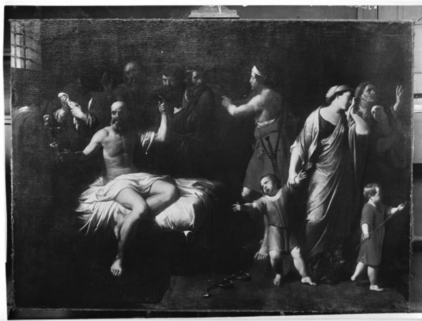
Figure 2. 'La morte di Socrate' by 'Maestro degli Angeli Pallavicini', imitator of Caravaggio, early 17th century. Available online: http://catalogo.fondazionezeri.unibo.it/scheda/opera/49885/Maestro%20degli%20Angeli%20Pallavicini%2C%20Morte%20di%20Socrate (accessed 1 May 2021).

After exhibiting his painting with that of David at the Salon, Peyron returned with a new version, in which he seems to have been