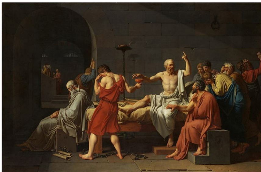
Figure 1. 'The Death of Socrates' by Jacques-Louis David, 1787, Metropolitan Museum of Art, New York. Available online: https://frear.gr/?p=20006 (accessed 1 May 2021).

Subsequently, this article presents a teaching proposal based on Harvard University's Artful Thinking Project, a model of artworks approach, which includes a set of actions through which the