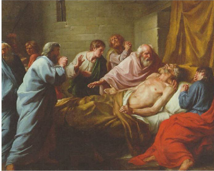
Figure 15. 'La mort de Socrate' by Jean-François Sané, 18th century. Available online: http://www.artnet.com/artists/jean-fran%C3%A7ois-san%C3%A9/the-death-of-socrates-cXwxzmsZ9bZTCC7BIWX6EA2 (accessed 1 May 2021).

intention of the artist to project the revolutionary nature of the depicted event.