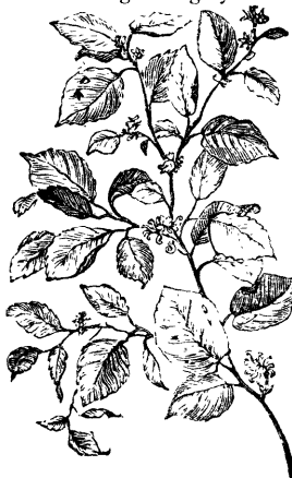
The Witch Hazel Plant.

This drug is highly commended by the British Medical Association's Committee on Therapeutics. Hazeline, being prepared from the fresh green twigs, contains all the valuable volatile principles of the plant Witch Hazel, and is much more uniform and reliable in its action than are the tinctures, fluid extracts, etc., prepared from the dried bark.