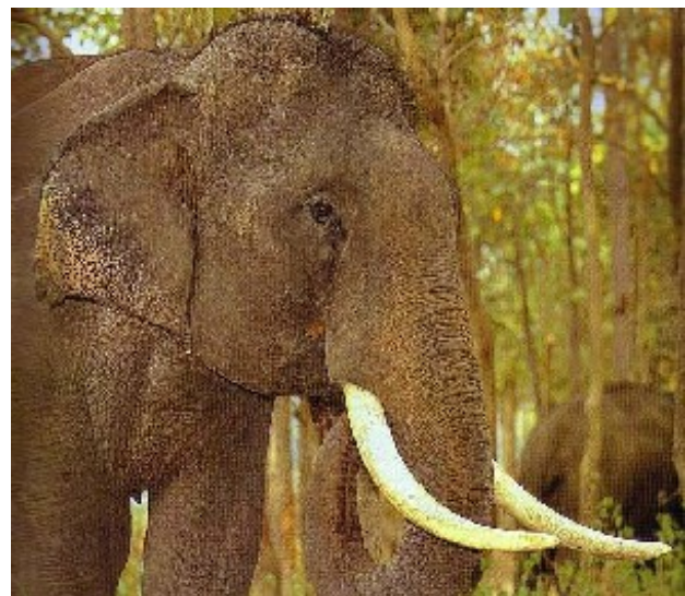
Elephant in southern Yunnan

just as at Bangka and Belitung (Billiton). We find volcanic activity in certain parts of Taiwan and Hainan, and earthquakes might damage Fujian or Hong Kong just as easily as the Philippines or Burma. It is also a commonplace that this whole region falls under the monsoon cycle and experiences typhoons, while botanists and zoologists, in parallel with each other, stress the fact that the flora and fauna of southern China bears great analogies to the light forests of Indochina, and that in earlier times elephants were common in the North and the South. Just as in Hainan, the coastal regions of southern China were also covered by tropical forests, the point being that forest felling began here much earlier than further South. Just as with Europe’s Mediterranean, then, the opportunity exists here for historians to study the differential retreat of the forests, occurring much earlier in the most economically developed countries: in the Muslim world retreating to the west, in China to the south.