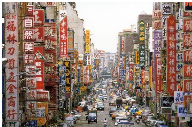
Postcard image of Taiwan

As for the two large islands of Hainan and Taiwan, which are like anchors cast out to sea from the Chinese continent, it is quite fascinating to compare their evolution. Both were initially occupied by non-Chinese populations, in the first case by Thais especially and by Austronesians in the second, so we could say that, from a certain perspective, they were both at base “Southeast Asian”. But if Hainan was Sinicised quite early and has never ceased to form part of the continental system, Taiwan was not really occupied before the seventeenth century, above all by farmers from Fujian; and we know what its recent evolution has been.