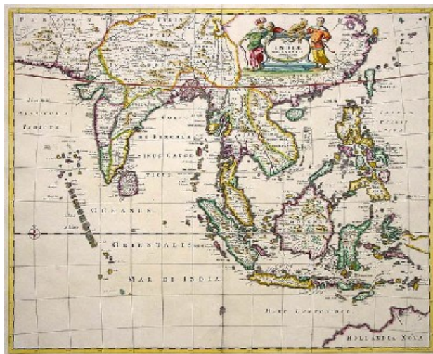
Map of the “East Indies,” circa 1662

But this sense of Southeast Asian “centring” is not all that new. If the names in current use are quite recent, it was still a very long time ago that the West first identified the totality of the “East Indies”—that space which the Chinese for their part had designated for long centuries as the Nanyang , or “South Seas”—as a sort of “party-wall” that both connects and separates the two giants, a zone where Chinese and Indian influences had historically met (from whence the fruitful concept of “Indochina”) and as a region of lesser political density, where structures were less rigid and where they could hope to find an advantageous zone of influence.