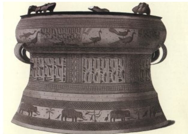
Dongson drum probably made in Vietnam circa 200 A.D.

the West and the Han in China), the discovery of an impressive number of bronze drums provides us with the outline of what is called Dongson culture, reaching west from the bronze rich southwest of China to the borders of Iran, and to the south passing through Vietnam, Malaysia, Sumatra, Java, Bali, Sumbawa, etc. That other technical information, like the use of braced ridge tiles, [7] could also have spread along with bronze working cannot be doubted. Some pre-historians are currently researching the presence of boat-coffins, found equally in Wuyishan, one of the highest places in northern Fujian, in the Niah cave (northern Borneo), and in several places in the Philippines.[8] Generations of students of mythology have also studied the similarities found among the various folklores of river-valley dwellers.