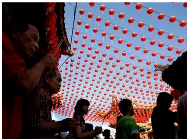
Ethnic Chinese offer prayers at a temple in Kuala Lumpur, February 2007

It is worth noting that such a spatial, and above all mental, “uncoupling” of Southeast Asia from southern China serves the interests of a lot of people. First of all, it allows Western Southeast Asianists to exhibit, unblushing, a fine ignorance of China (no small advantage, when we consider the difficulties we know await the apprentice Sinologist...). It is also reassuring: by clearly isolating fields, it justifies ignorance in the name of a supposedly indissoluble and airtight compartmentalisation. The thing is also probably done to please many people from the countries involved, Indonesians, Malaysians, or even Vietnamese, who rarely like to think of their large neighbour, or to measure themselves against it, and would all prefer to create a collective dead-end in its respect (despite the dangers this might represent for their own futures). Let us add, too, that it is by no means certain that this approach would not also appeal to many responsible Chinese of the continent who, still concerned about the approach of “southern miasmas”, prefer to remain within the shelter of their borders in order to better imagine “the State”. ... Today only Japanese and Taiwanese businessmen have a clear awareness of the intellectual heresy that this fictive “wall” represents: Japanese and Taiwanese businessmen, and Chinese businessmen from