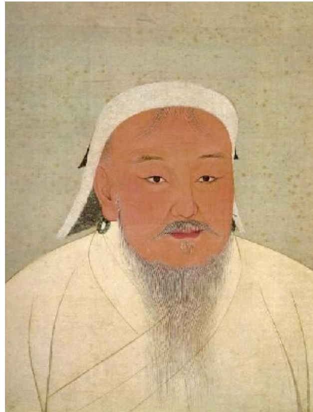
Painting of Khubilai Khan

However, the great turning point for Southeast Asia, as in fact for all of Eurasia, occurred in the thirteenth century, with the “Mongol moment” in world history, [14] and then in the fourteenth century when, almost immediately after, unrest in the Turkish principalities of Central Asia closed the continental trade route that Marco Polo and Rubriques had taken (as well as Rabban Sauma, from the other way around). From this era, the “weight of the North” (that is to say, from southern China) scarcely ceased to prevail in Southeast Asia. Until then, the main impacts, whether Buddhist or Muslim, had in reality mostly come from the southwest, with “Indianisation” easily forming the most important such phenomenon. But, henceforth, Chinese ports would make the most obvious impact. From the thirteenth century, there was a Chinese community at Angkor; in the fourteenth century, there were Chinese settled in Siam who founded the new commercial city of Ayutthaya, [15] while we also hear at that time of communities established on the north coast of Java, notably at Gresik.