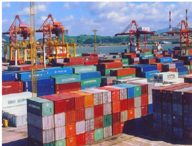
Containers at Fuzhou port

From the sixteenth century, things changed a bit, partly due to the presence of Europeans—the Portuguese, and then the Dutch and English—but only in part for this reason. Little by little, Fujian's primacy was receding and Canton taking back her former place, but under a less liberal system: 13 hang , or guilds, were set up there in 1557, and in 1720 they would begin the Kohong system that allowed Chinese mandarins better control of Westerners. One might reflect from this that, whenever China opens up via Canton, it is always done less widely and in a more controlled fashion than through Fujianese ports.