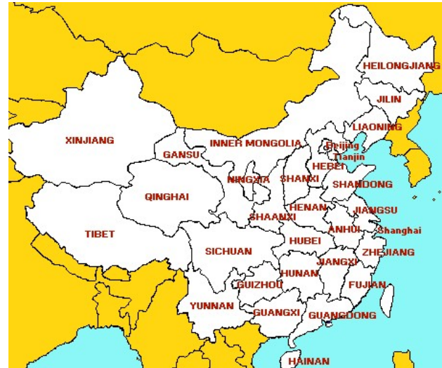
Map of administrative divisions in China

At this point, we can affirm that wanting to understand Southeast Asia without integrating a good deal of southern China into our thinking is like wanting to give an account of the Mediterranean world after removing Turkey, the Levant, Palestine, and Egypt. By this new "centring"—or rather, by restoring the centring—geography can and should help us to go beyond the received ideas that a certain style of history wants to us preserve, by insisting on staying too close to the facts (or to certain facts).