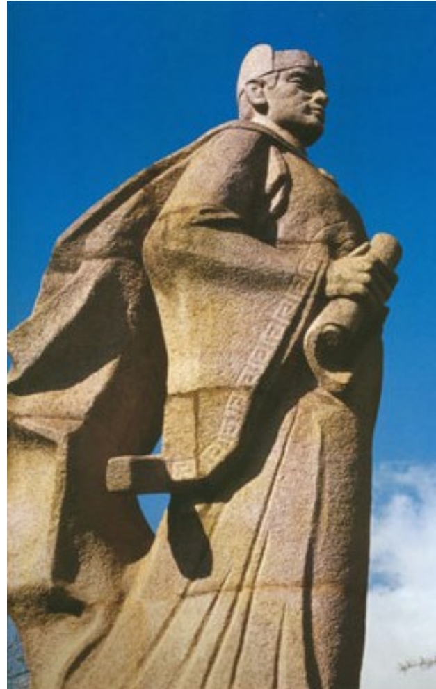
Statue of Chinese admiral Zheng He (1405-1433)

From this point on, we could say that the circle was closed and that henceforth the Nanyang operated as a Southeast Asia “Mediterranean”. From the thirteenth to the sixteenth centuries, we witness the remarkable development of south Fujian’s large ports: Zhangzhou and Quanzhou, then Amoy (or Xiamen). In the last two cases, a wealth of Muslim inscriptions attests to the presence of a large foreign community, comprising Arabs and Persians. Powerful Hokkien merchants now began setting up bases not only in Java, Patani, and the Philippines, but also in Guangdong and Hainan. In parallel, at the same time, a whole series of independent merchants, Japanese and Chinese (whom we call the wokou ), took advantage of the favourable circumstances to develop a private commerce not only between ports in China and Japan but also in Southeast Asia, where no state watched over them.