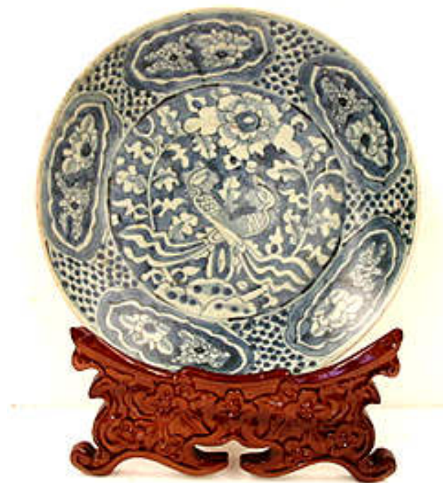
Early Ming plate found on shipwreck near Ternate, Moluccas, eastern Indonesia

longer to establish there. We can put together a rough chronology of the establishment of these trade routes, by analysing certain texts, initially mainly Arabic and Chinese ones, but also in particular by using the data of Chinese ceramic exports, which can be found on all the shores and which have been well studied in recent decades.