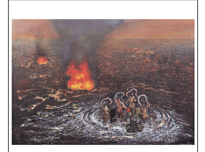
#2 "Revelation from the Sea: Tsunami" (2011) Mixed media 1120 x 1620mm

In "Revelation from the Sea: Tsunami" (Image #2), the first work in the series, shinshou or divine guardian deities rise up out of the dark, angry sea. Fires burn on the black water and the sky beyond the horizon glows ominously. The four devas, originating in India but also appearing in the Buddhist pantheon across east Asia, hold broken parts of a remote control device, now useless fragments of the civilization that has been washed away in the tsunami, a civilization that for Tomiyama has been driven by the "relentless pursuit of wealth and convenience" that began with the Age of Exploration in the mid-15<sup>th</sup> century. The deities have come from afar to admonish humans who have so foolishly imagined they can control nature and to warn against the frailty of human existence in the face of possible future devastation.2