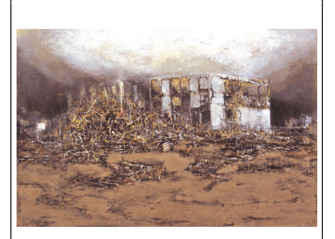
#4 JAPAN: Nuclear Power Plant (2011) Oil on canvas 970 x 1455

In the summer and fall of 2011, more questions were being asked about the actual state of the nuclear power plants in Fukushima. It was becoming clear that only limited information had been released in the days following the disaster and that access to information and documentation were still restricted in subsequent months. In the midst of ongoing uncertainty about the state of the Fukushima power plant, Tomiyama began to imagine a work that would also make the devastation at the Fukushima site more visible.