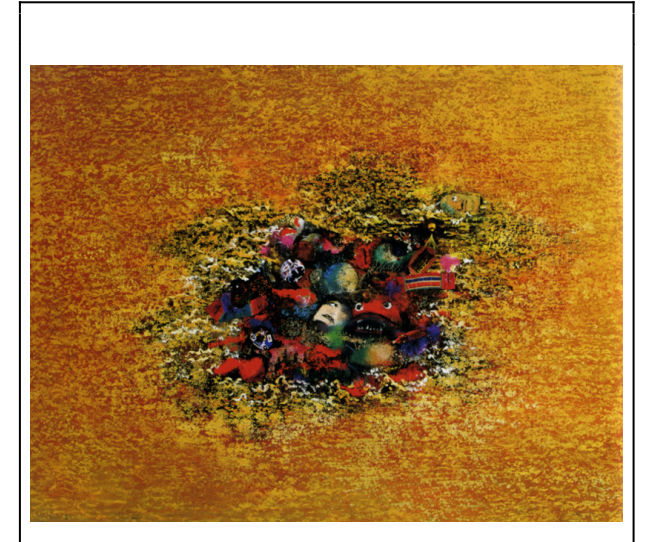
#1 "Adrift" (2008) Oil on canvas 800 x 1000mm

remember histories of war and natural disaster, linking them to our own turbulent times. In the paintings and collages that comprise the Hiruko series, for example, we glimpse burning towers on the sea floor reminiscent of 9.11, and puppets swept away in a swirling tsunami. (Image #1)