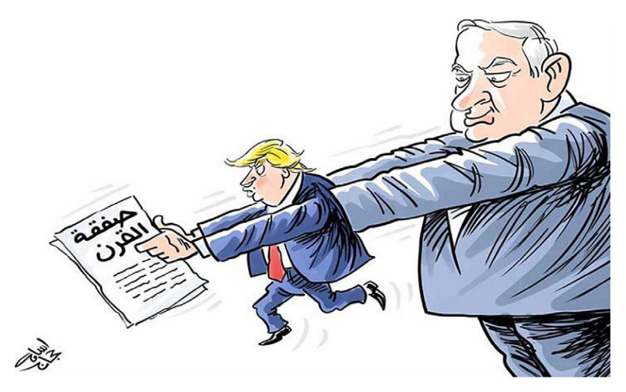
Fig. 5. The metaphor (THE DEAL OF THE CENTURY IS A PIECE OF PAPER CONTROLLED BY NETANYAHU). Caption: Deal of the Century.

the action of using the pencil to write, whereas the in-built eraser is used to wipe out some terms of the agreement and contains a metonymy for the action of using the eraser to delete some terms.