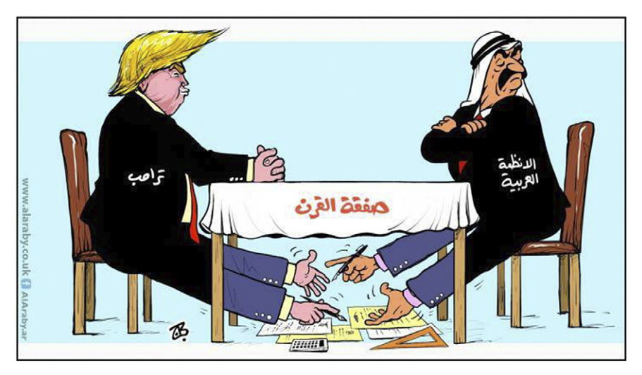
Fig. 3. The metaphor (THE DEAL OF THE CENTURY IS A SITUATION INVOLVING A TABLE CLOTH). Caption: Deal of the Century.