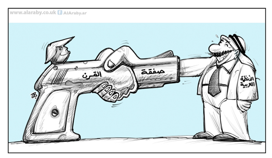
Fig. 11. The metaphor (the deal of the century is a gun with trump's head and shaking hands serving as a barrel). Caption: Deal of the Century.