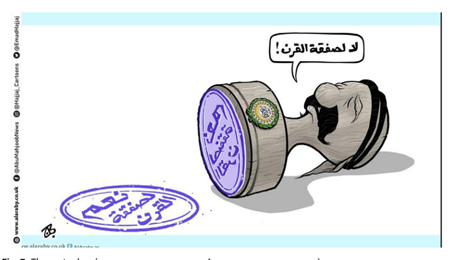
Fig. 7. The metaphor (The deal of the century is an Arab man serving as a stamper). Caption: No to the Deal of the Century, Yes to the Deal of the Century.