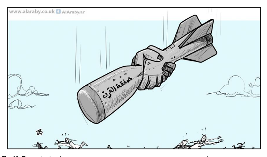
Fig. 12. The metaphor (the deal of the century is a rocket shell with a head of human fist). Caption: Deal of the Century.

a situation involving weapons. It includes submetaphors, such as the deal of the century is a gun with trump's head and shaking hands serving as a barrel (Fig. 11) and the deal of the century is a rocket shell with a head of human fist (Fig. 12).