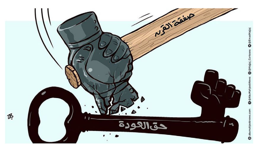
Fig. 4. The metaphor (THE DEAL OF THE CENTURY IS A HAMMER WITH A HEAD OF HUMAN FISTS). Caption: Deal of the Century and the Right to Return.

onto a situation where the agreement does not contain everything it should. The pencil is metonymic for the result of the action of using the pencil to write (INSTRUMENT FOR ACTION FOR RESULT); similarly, the eraser is metonymic for the action of using the eraser to delete terms (related to Palestinians' right to return to their homeland). This metaphor can be represented using a single-scope blend as follows: