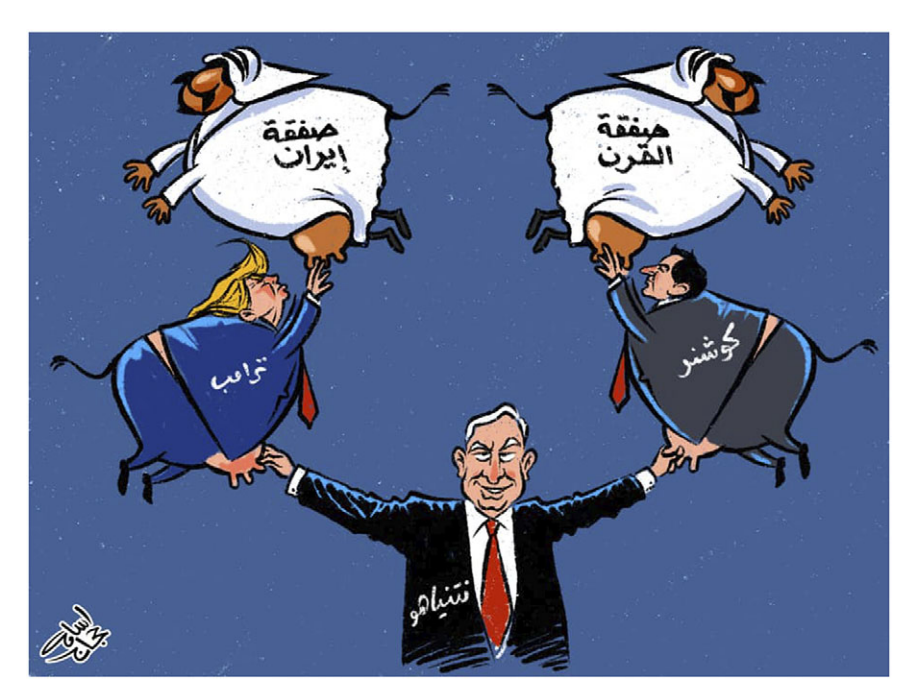
Fig. 10. The metaphor (THE DEAL OF THE CENTURY IS A COW WITH A HUMAN'S HEAD). Caption: Iran and Century Deal.

He heals him, he will sell his camel for 1 Dinar. The man was cured, and now he has to keep his promise to God, but he could not live with selling his camel for only 1 Dinar. So, he was advised by a wise man to sell the camel for 1 Dinar and thus keep his promise to God, but to sell what the camel is carrying for 99 Dinars. Thus, the man got himself