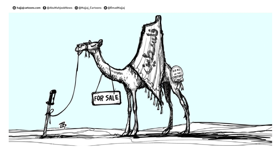
Fig. 9. The metaphor (THE DEAL OF THE CENTURY IS A CAMEL FOR SALE). Caption: Deal of the Century.