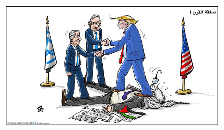
Fig. 8. The metaphor (THE DEAL OF THE CENTURY IS A DEAD PALESTINIAN MAN). Caption: Deal of the Century and Trump.