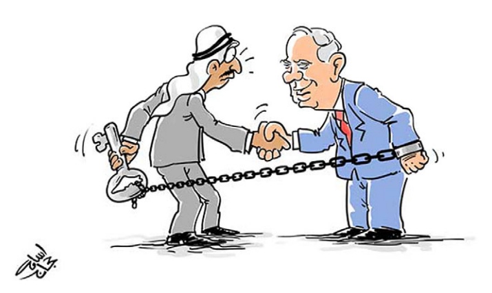
Fig. 2. The metaphor (THE DEAL OF THE CENTURY IS A SITUATION INVOLVING A KEY CHAIN). Caption: Deal of the Century.

wipe out ?alaqadiyyah lfilasti:niyyah 'the Palestinian Cause'. The source domain is cued visually, and the mappings involved are cross-modal of the type pictorial source-verbal target. The technique used to construe the target is compelling context where the context of the cartoon compels the viewer to view one entity (deal of the century) in terms of another (an eraser on a pencil) by featuring it as if it was a different entity (Bobrova, 2015). Looking at the cartoon, we see an apparent peace instrument that wipes out rights in terms of an eraser which wipes out part of the content of a piece of paper. There is a paradox involved in using a pencil with an in-built eraser to write an agreement. The pencil can be used not only to write out the terms of the agreement, but also to delete them. It is this pictorial source that maps