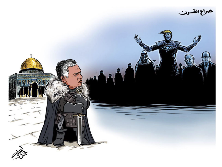
Fig. 14. The metaphor (THE DEAL OF THE CENTURY IS A WAR OF THRONES). Caption: Game of the Century.

deceiving Arab leaders by convincing them to give big portions of Palestine to Israel while promising them compensation in the future, yet the latter will never happen as implied by the Jordanian marriage story. This story evokes the monomodal (verbal) metaphor the deal of the century is the Jordanian Marriage story. The mappings are deceit, bluffing, and trickery.