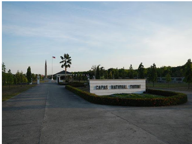
Figure 6: Capas National Shrine.

decaying state of the Camp O'Donnell site. This may be interpreted as the Cory Aquino administration's desire to revive and rehabilitate US-Philippine Relations by reconstructing and developing Camp O'Donnell as a public history shared by both Filipinos and Americans.