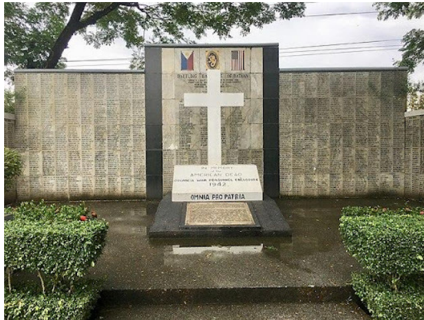
Figure 7: “Omnia Pro Patria in Capas National Shrine, a cross dedicated to fallen American soldiers in Bataan during Japanese occupation.” (Wikimedia Commons. Photograph by Julian Shirwood Nueva, 6 November 2019.)