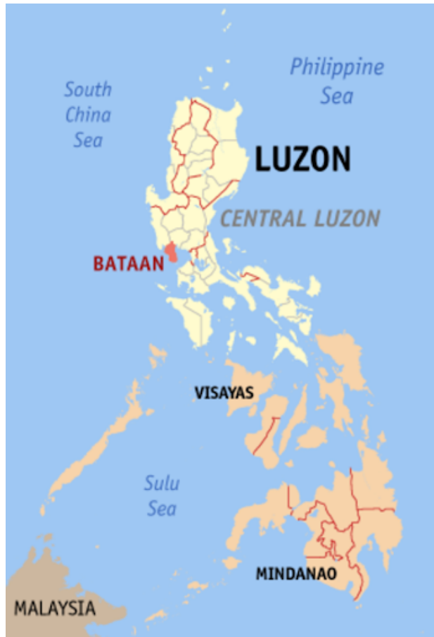
Figure 1: “Map of the Philippines showing the location of Bataan.” ( Wikimedia Commons . Map created by Eugene Alvin Villar, 2003.)