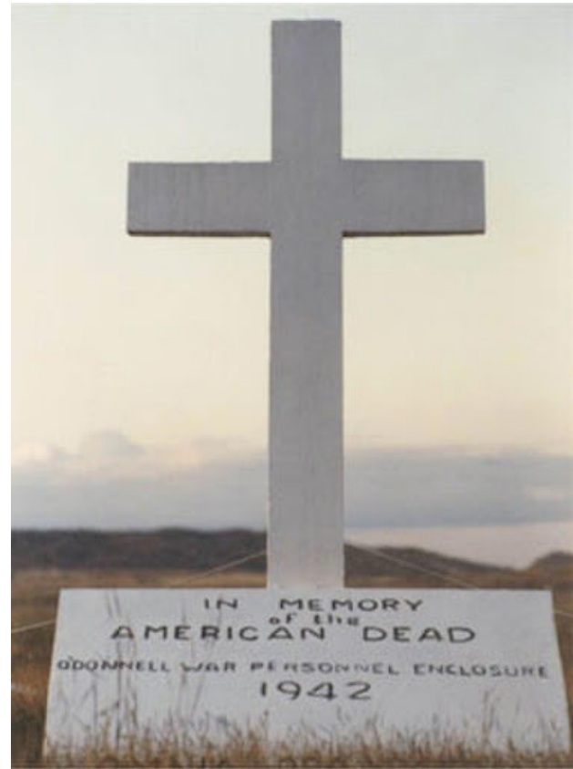
Figure 5: "The Camp O'Donnell WW II American POW Grave Memorial Cross (1942).

The result was a monument composed of a cross and a base, with a dedication "IN MEMORY OF THE AMERICAN DEAD/ O'DONNELL WAR PERSONNEL ENCLOSURE/ 1942," and the words "OMNIA PRO PATRIA" (Ibid.). A famous 1945 photograph of Gen. Douglas MacArthur reverently standing before the American monument has been widely circulated. Apart from these references to the American monument, there is no other mention of it in war crimes records or other documents.