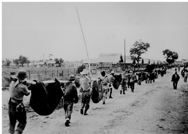
Figure 4: "Photograph of American Prisoners Using Improvised Litters to Carry Comrades."