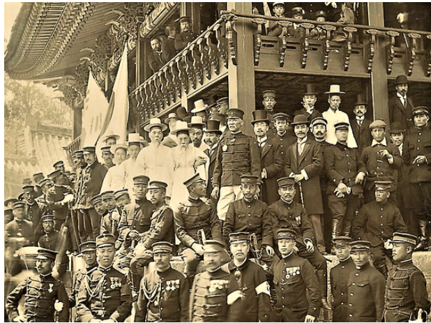
Figure 4: General Kuroki Tamemoto (黒木 為楨1844-1923) and his army, on the balconies of the Changdeokgung Palace (昌德宮) in Seoul, 1905.

While it would be impossible to thoroughly examine the enormous changes that took place over the course of this period, the articles in this issue aim to highlight some cases and questions at the center of Japanese engagement with concepts of race and empire , as well as how these ideas came to shape ideology and political practices in the Meiji era. Each of the articles tackle these issues through explorations of Japan's direct (at times, personal) exchanges with European leaders and ideologists, invited specialists, missions, journeys and individual encounters in Europe and the USA. Such exchanges had been designed as opportunities to learn, explore and adapt Western ideologies, technologies, practices, political and financial systems, industrial and scientific knowledge, with the end goal of situating Japan on a new stage of development paralleling that of Europe, where the Japanese "race" was equivalent to the "white race" of Europe.