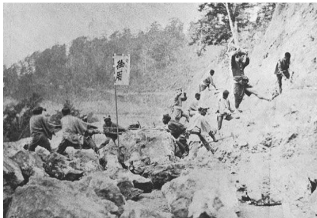
Figure 7: Tamoto Kenzō, Demolishing hard rocks for mountain road no. 737 in Musawa, Meiji 5 (1872) Albumen print 14.5X20cm. @ Northern Studies Collection, Hokkaidō University.

strong or weak. The double movement of association with Europe and distancing from Asia produced a new subtext to the binary opposition between the “advanced” and “sophisticated” versus the “primitive” and “simple-minded.” That is, the logic behind Western colonialism was re-applied to relations between Asian nations and cultures, without the explicit binaries of East and West. Ultimately, this double movement laid the foundations for racial ideologies and imperial practices. 12