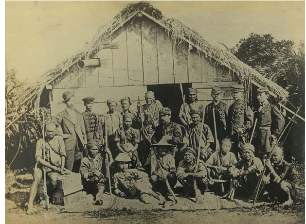
Figure 3: Soldiers of the Japanese expedition under Commander-in-chief Saigō Jūdō (西郷 従道 1843-1902), pictured with leaders of Seqalu (Native tribe of Taiwan), 1874.

Japan's process of modernization was accompanied by the adoption of these ideologies and practices, driving Japan's leaders to establish their nation-state, the imagined community of "Japan," and to follow the racial discourse dominating the political sphere, with a small twist: although Japan had been grouped with other Asian nations in the prevailing discourses of race, it nevertheless strove to associate itself with the white, European/Western race. Leaders and ideologists, for example, assigned inferior racial attributes to the different groups and ethnicities on or around the Japanese islands, gradually pulling Japan away from Asia, and closer to Europe. The Meiji era (1868-1912), therefore, saw Japan's passage into modernity and identification as a modern state first within its own boundaries, and then, in terms of broader affiliations and international relations, Japan's efforts to associate itself with Euro-American processes, developments and racial discourses, simultaneously distancing itself from Asia in general, China (and Korea), in