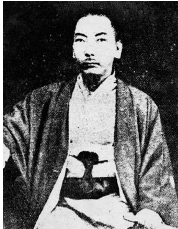
Figure 8: King Shō Tai (尚泰 1843–1901), the last king of the independent Ryūkyū Kingdom.

The problems that arose from the annexation of Hokkaidō and the Ryūkyūs were numerous, and challenged Japanese authorities’ abilities to cope with Japan’s expanding territories, as well as with the ethnic groups that had heretofore not been considered Japanese. The authorities therefore had to debate the best way to incorporate these new territories and their assets, such as raw materials and land for cultivation, into the Japanese system. Pia Jolliffe’s article examines the role of forced labour in the context of Ezo/Hokkaidō’s colonization, drawing attention to how different groups of subaltern people – the indigenous Ainu, political convicts, indentured labourers and Korean workers – contributed to the making of imperial Japan’s first colony and the building of the modern Japanese nation state. Yet, though they worked for the same Japanese ruling class, these subaltern labourers were not united. Jolliffe highlights how their experiences were largely shaped along ethnic, gendered and generational lines.