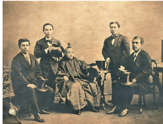
Figure 5: The Iwakura Mission. Tomomi Iwakura (岩倉 具視 1825 - 1883) , Head of the Mission, is seated at the centre, in traditional clothing, London, 1872.

While it would be impossible to thoroughly examine the enormous changes that took place over the course of this period, the articles in this issue aim to highlight some cases and questions at the center of Japanese engagement with concepts of race and empire , as well as how these ideas came to shape ideology and political practices in the Meiji era. Each of the articles tackle these issues through explorations of Japan's direct (at times, personal) exchanges with European leaders and ideologists, invited specialists, missions, journeys and individual encounters in Europe and the USA. Such exchanges had been designed as opportunities to learn, explore and adapt Western ideologies, technologies, practices, political and financial systems, industrial and scientific knowledge, with the end goal of situating Japan on a new stage of development paralleling that of Europe, where the Japanese "race" was equivalent to the "white race" of Europe.