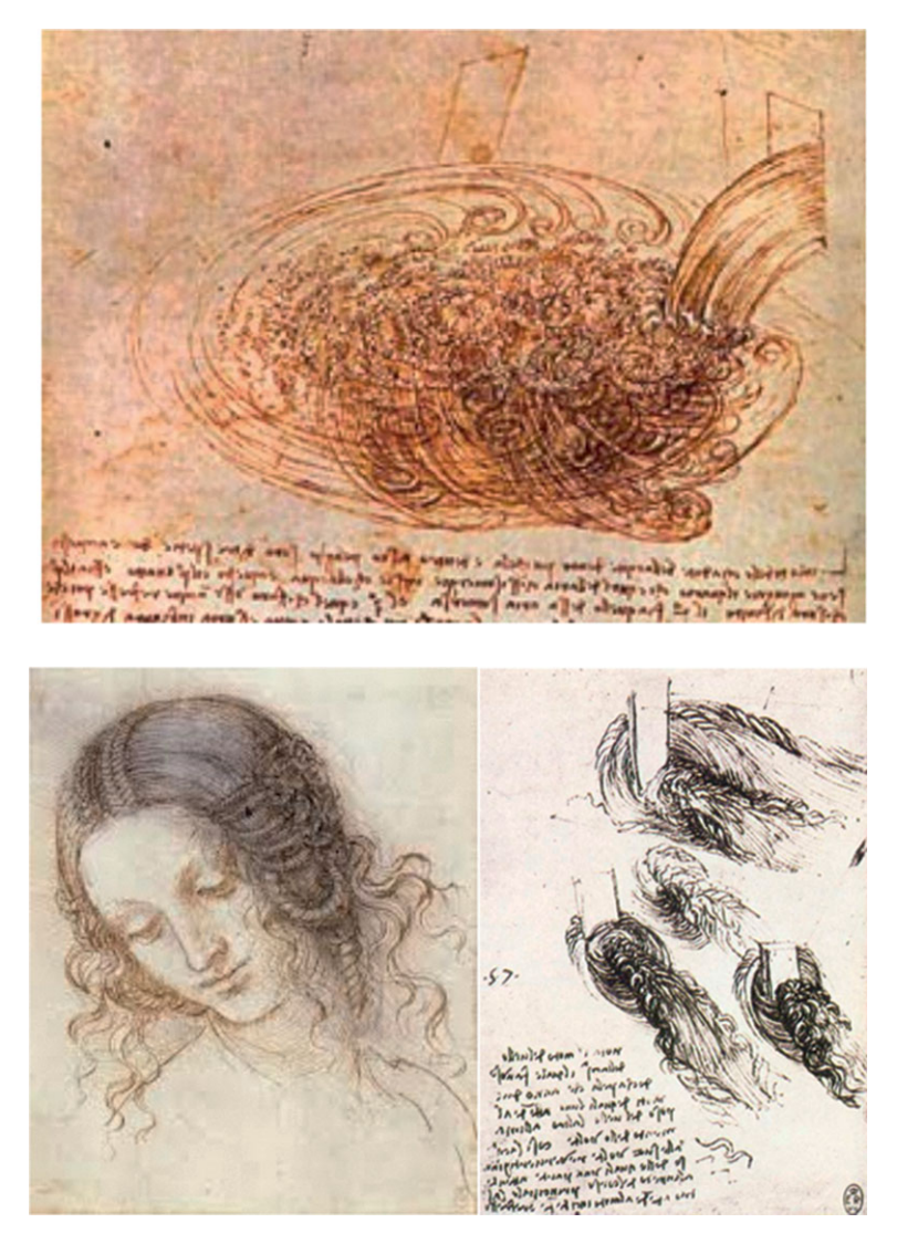
Figure 1.1 Leonardo da Vinci's studies of water (circa 1507), pen and ink on paper. (Top) Turbulent water in a pond. (Bottom) Leonardo's analogy between turbulent water flow and braided hair. Leonardo da Vinci, Public domain, via Wikimedia Commons.

equations alone. Because of its intellectual challenges and practical importance, it continues to challenge the attention of physicists, mathematicians, and engineers. One reason why so many scientists from various disciplines have to deal with one aspect or another of fluid turbulence is that the phenomenon spans an enormous range of scales – more than thirty orders of magnitude – from astronomical, when turbulent description is useful for explaining the shapes of spiral galaxies, the