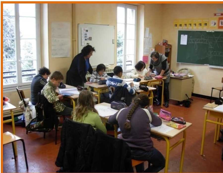
Figure 2. 10 young people with learning disabilities in a specialised class at Collège Sévigné in Marseille do their Greek.