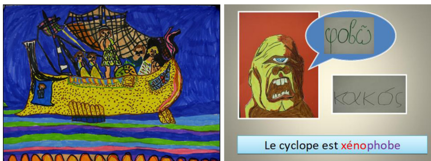
Figure 3. Work completed by students with special educational needs at Nasicaa.