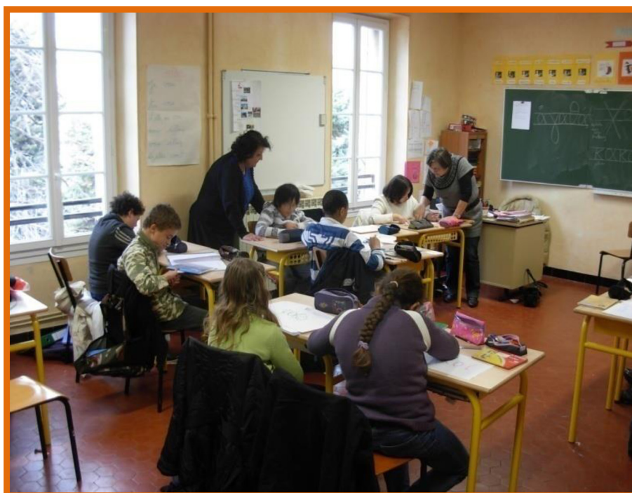
Figure 2. 10 young people with learning disabilities in a specialised class at Collège Sévigné in Marseille do their Greek.