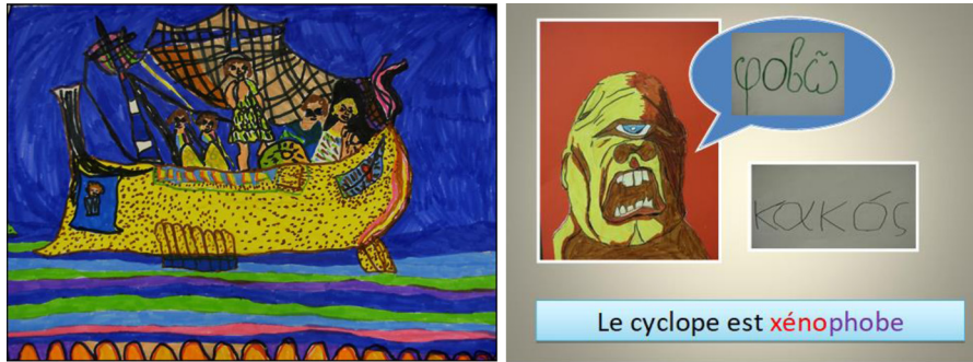
Figure 3. Work completed by students with special educational needs at Nasicaa.