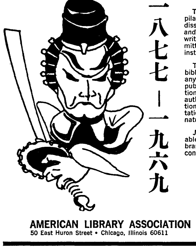
Compiled by Frank J. Shulman For the Center for Japanese Studies of The University of Michigan

The first single-source compilation of nearly all doctoral dissertations relating to Japan and Korea. Covers dissertations written in 14 languages and submitted to higher degree-granting institutions in 26 countries.