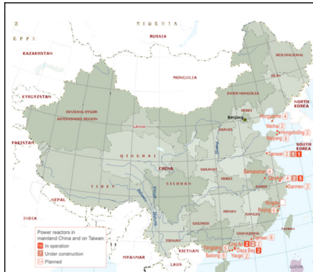
Mainland China in 2010 had 16 nuclear power reactors in operation, 7 under construction, and 34 planned. China's existing and planned nuclear power sites (IAEA map based on July 2010 data.)

Prior to Fukushima, China had been pursuing the world's most ambitious nuclear power program. Following Fukushima, this is still the case. Its nuclear expansion goals are primarily driven by closely related energy security and carbon emission concerns and, relative to its other power generating options, the fact that it is arguably a relatively environmentally friendly and efficient source of electricity. 2 This underscores the significance of China's decision to forge ahead with its 12th Five Year Plan target to install 40 additional gigawatts of nuclear capacity by 2015.