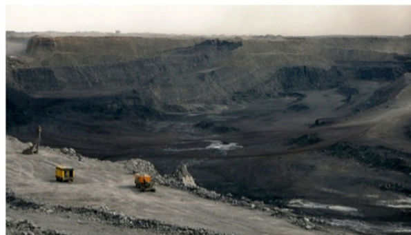
Tavan Tolgoi (Five Hill)

The uncertain progress of the Tavan Tolgoi project illustrates the headaches facing Mongolia as it tries to reap its resource bonanza on behalf of its citizens even as the remorseless economic logic of globalization demands marginalization of their interests. Tavan Tolgoi, in the Gobi Desert less than 300 kilometers from the Chinese border, contains over six billion tons of coal reserves, including 1.8 billion tons of coking coal, a premium and profitable item used in the iron and steel industry.