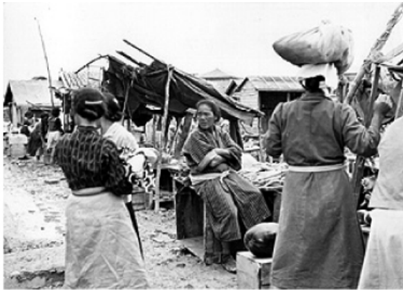
Figure 3. Black Market Scene in Naha, Okinawa, circa 1948

Okinawa. The emergence of new social classes in postwar Okinawa thus developed simultaneously with the geographical distribution of the US military bases and black markets.