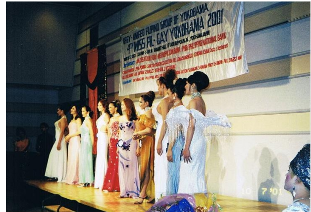
Figure 3: Filipino Hostess and Host Club Workers Participating in a "Miss Fil-Gay" (Filipino Gay) Beauty Pageant

Some of the common lines of these depictions of Filipina/o entertainers are that they are essentially sex objects even if they consider themselves "talents." However, hostessing or hosting and prostitution in Japan are not one and the same. Nor are the water trades and the sex industry identical. While Douglass neglects to provide the source of his information, based on the 1997 immigration statistics he used (see Ministry of Justice 1998) the closest number to the figure of 100,000 "sex-worker" entrants is the sum of Filipino female entrants to Japan (n=96,041). This suggests that the undistinguished, faceless mass of Filipinas coming to Japan are all incarcerated in morally denounced sectors of the night businesses regardless of their legal statuses and individual situations. And, in the views of Douglass, Matsui, Sellek, and many others, these women come to Japan, not to entertain customers through hosting, hostessing, and music/dance shows in the ways that many workers, such as Cherry and Santiago and Dacanay's informants, describe their jobs. [23]