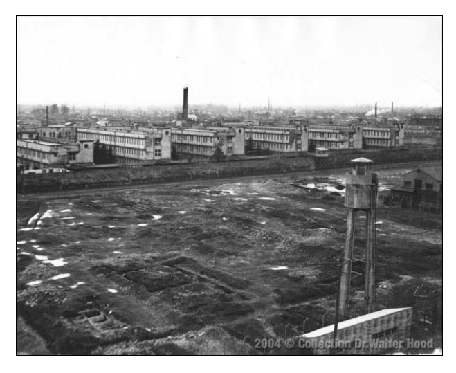
Sugamo Prison, 1947

The mitigation of the sentences of war criminals and the agitations for parole symbolized the popular reaction to the Tokyo War Crimes Tribunal. After the Peace Treaty went into effect, 'Sugamo Prison' had its name changed to Sugamo Detention Centre. Utsumi Aiko from Keisen University points out that "the parole-for-war-criminals movement was driven by two groups: those from outside who had 'a sense of pity' for the prisoners; and the war criminals themselves who called for their own release as part of an anti-war peace movement. The movement that arose out of 'a sense of pity' demanded 'just set them free (tonikaku shakuho o) regardless of how it is done'. The situation heated up to such an extent that expressions like 'if you are Japanese, sign!' became a catch phrase."