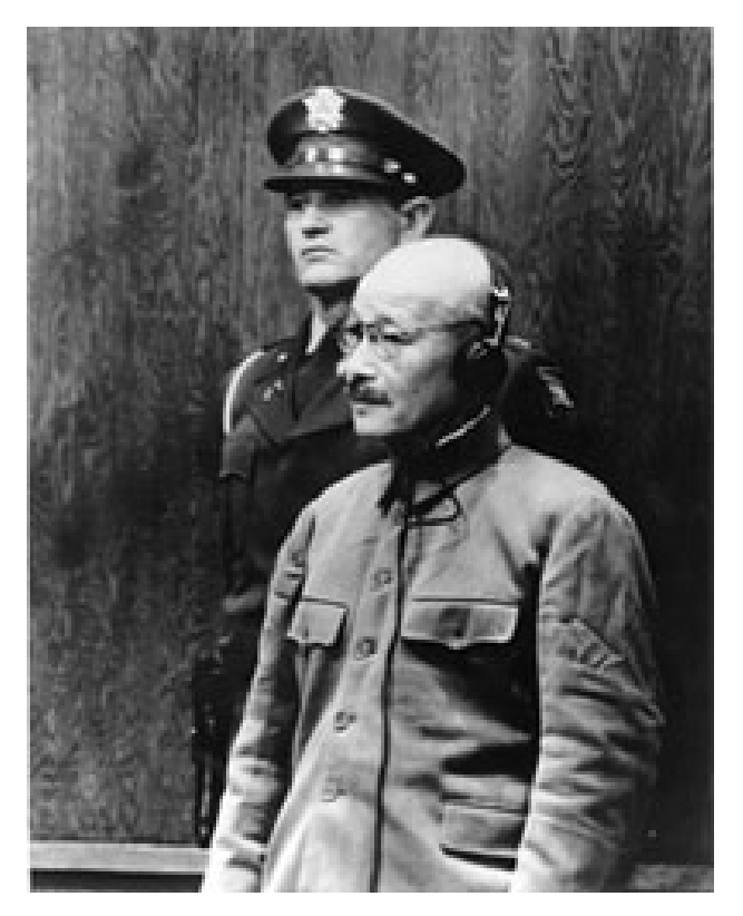
Tojo Hideki awaits sentencing, Movember 24, 1948.

The Home Affairs Ministry compiled a report on popular reactions from each region, but recorded the overall situation as follows: "Regarding General Tojo's decision to commit suicide, those completely sympathetic to the timing, method, and attitude shown in the suicide are exceedingly rare, and most people are thoroughly critical and reproving. The main reactions are as follows: