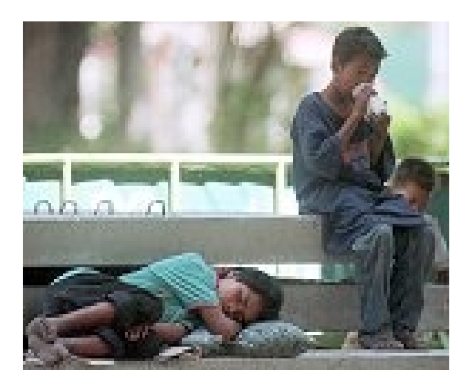
At-risk street children in Bangkok

I vividly recall a conversation with a senior Thai monk during the 2001 conference of the International Association of Buddhist Studies in Bangkok. I asked the Venerable, "Why don't Thai Buddhist leaders speak out against the rampant sexual slavery imposed on children in Bangkok and other Thai cities?" He replied, "You must understand that these girls did something evil in their past lives, perhaps committing adultery. That is why they ended up as prostitutes in this life. Of course, there is hope for them in their future lives."