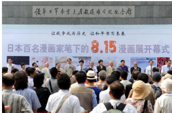
The opening of the manga exhibit in Nanjing on August 15, 2009, the anniversary of Japan's surrender

KŌNO Who was your point man among the manga artists?