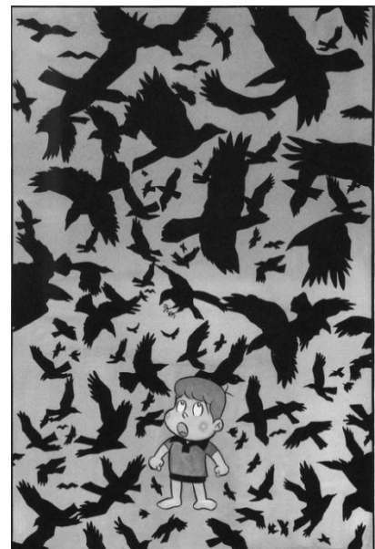
The Red sky and crows © Akatsuka Fujio

When I saw the book, it was like a bolt of lightning. I felt intuitively that we could make use of it to communicate the Japanese experience to the Chinese people. First of all, I wanted to translate it and get it published in China. Everyone in the Japanese Foreign Ministry and every China expert I talked to said it couldn't be done, but I figured nothing ventured, nothing gained. I inquired at four top publishing companies in China, but they all turned me down. "The Party will never allow it," they said. "Even if we published it, no one would buy it." Of course, I had never thought of it as something with real market potential. I just thought if we could only get a Chinese edition out in book form, somebody was bound to read it, and that could set something in motion.